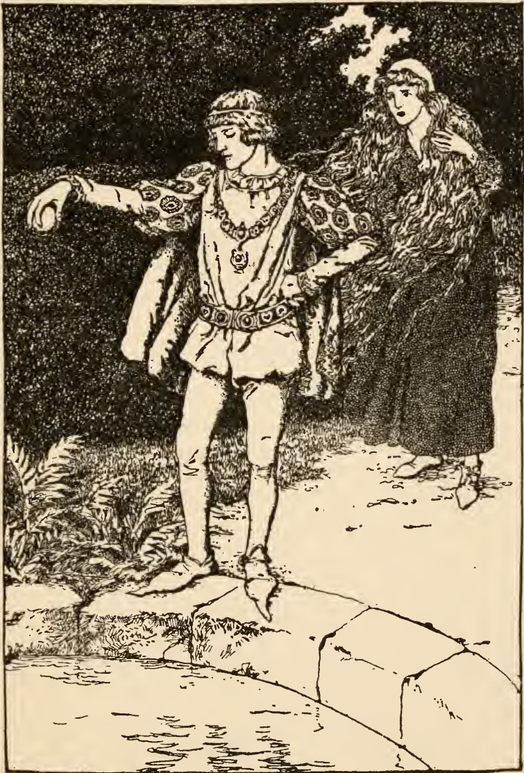
MERLIN DROPS THE BALL INTO THE FOUNTAIN