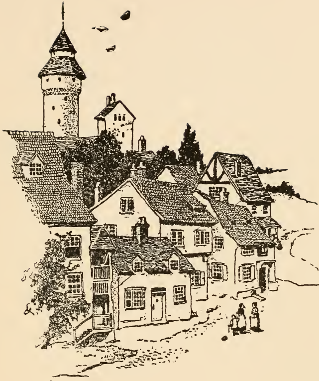
THE TOWN OF WEIR