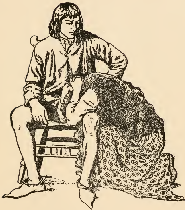
THE GOLDEN ARCHER AND FELICE