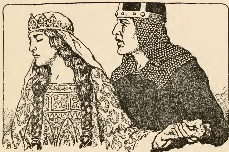
KING THEOPHILE AND QUEEN ELENE