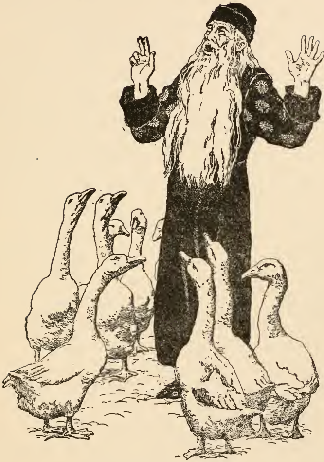
THE WIZARD'S FIRST AUDIENCE