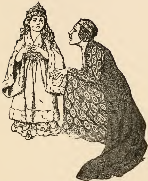
THE NURSE SEES HER WEDDING IN THE PRINCESS'S TEARS