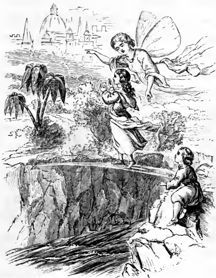
THE LOST SYLPHID. Page 95.