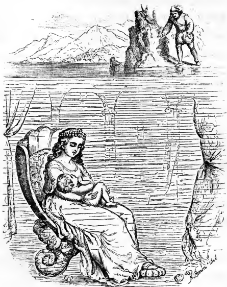
THE WATER-KELPIE. Page 70.