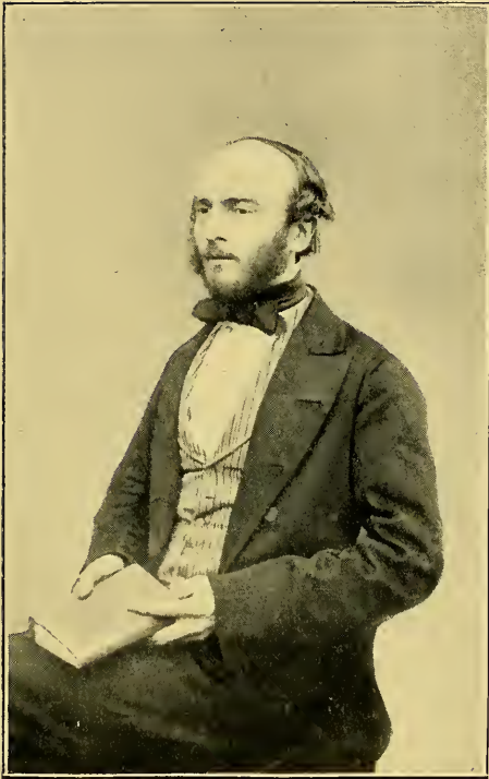
CHARLES BAGOT CAYLEY.