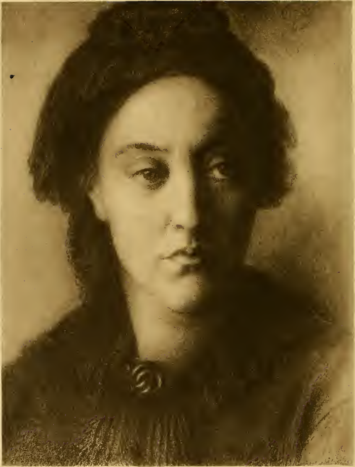
Christina Georgina Rossetti.

From a tinted-crayon drawing by Dante Rossetti 1877.