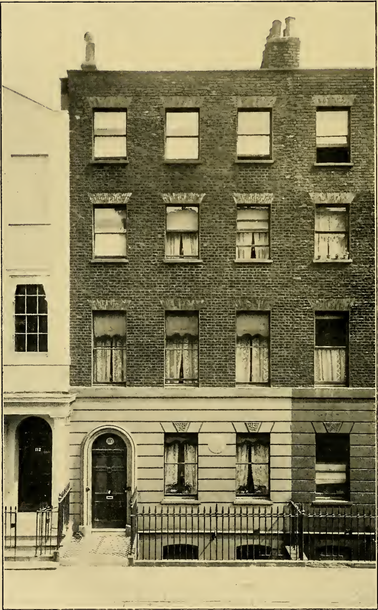
CHRISTINA GEORGINA ROSSETTI'S BIRTH-HOUSE. 110 Hallam Street, Portland Place; formerly 38 Charlotte Street.