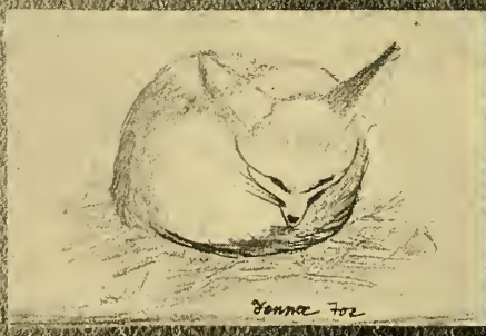
FROM PENCIL DRAWINGS BY CHRISTINA ROSSETTI.

Animals in the Zoölogical Gardens, London, c. 1862.