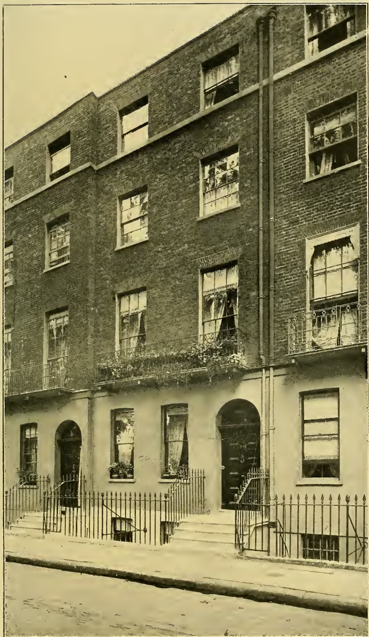
THE HOUSE IN WHICH CHRISTINA ROSSETTI DIED. 30 Torrington Square.