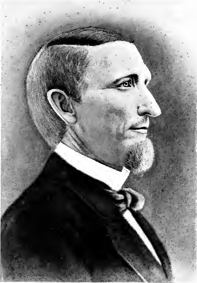
JUDGE WILEY POPE HARRIS.