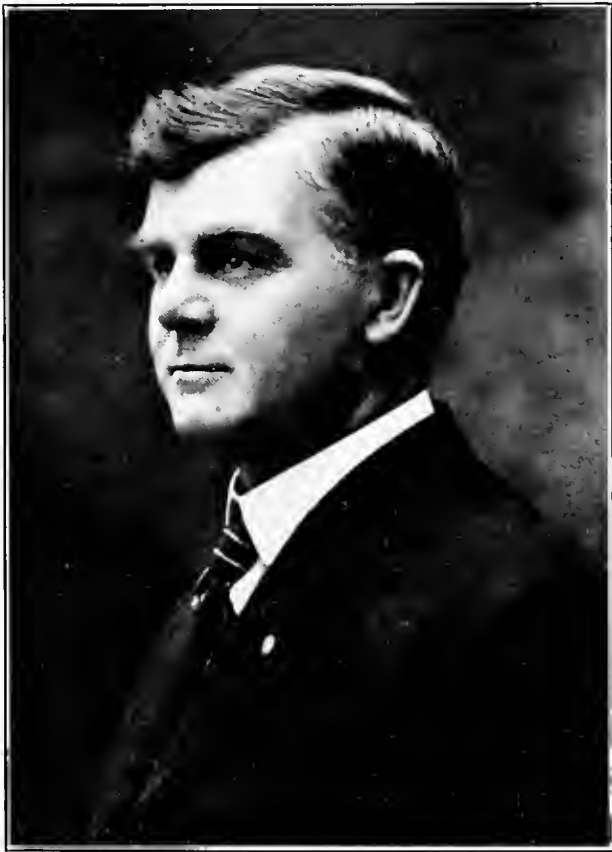
SEN. NATHANIEL BACON EARLY.