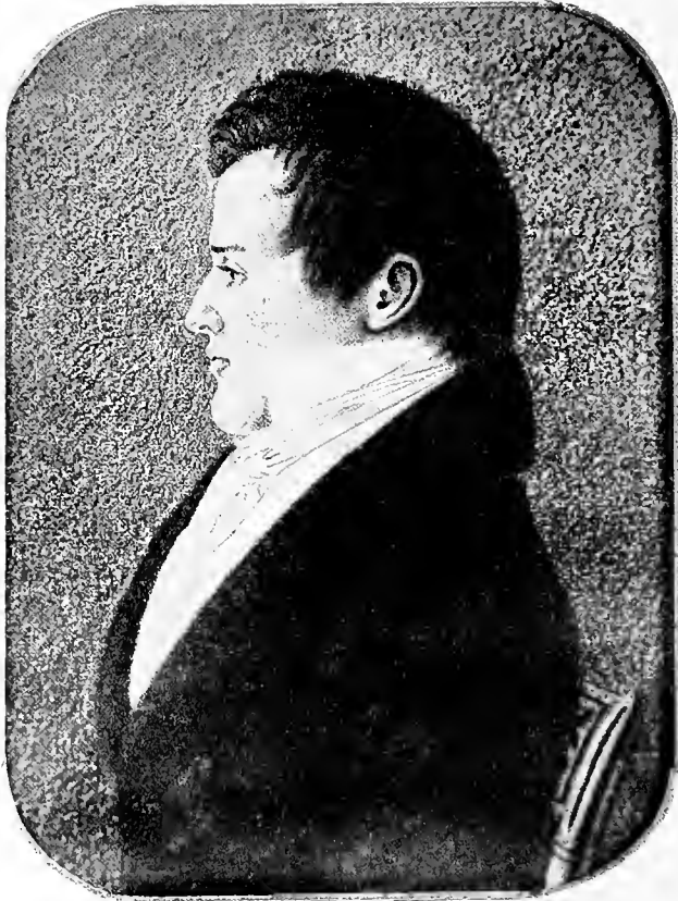
CAPTAIN SAMUEL HY. EARLY, from a crayon drawing.