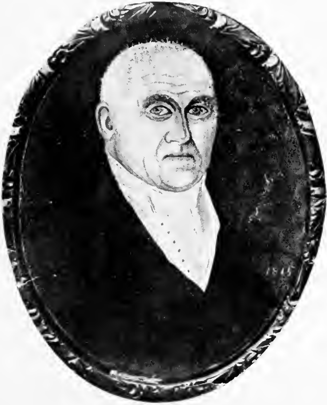
CAPT. CHARLES CALLAWAY, from a miniature painting.