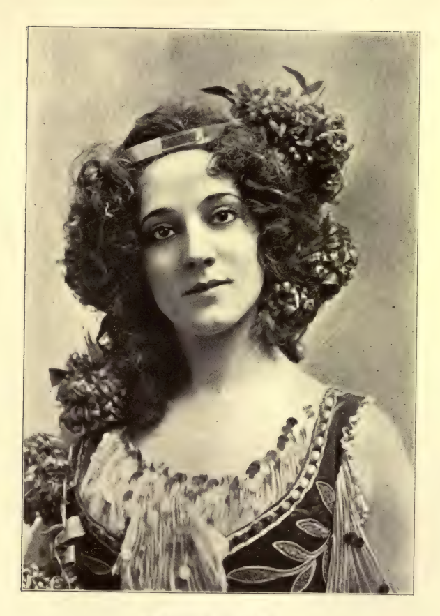
MABELLE GILMAN In "The Casino Girl."