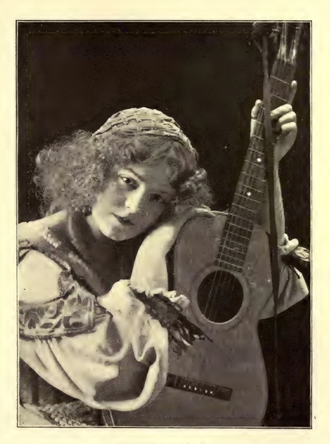
VIRGINIA EARLE As Winnifred Grey in "A Runaway Girl."