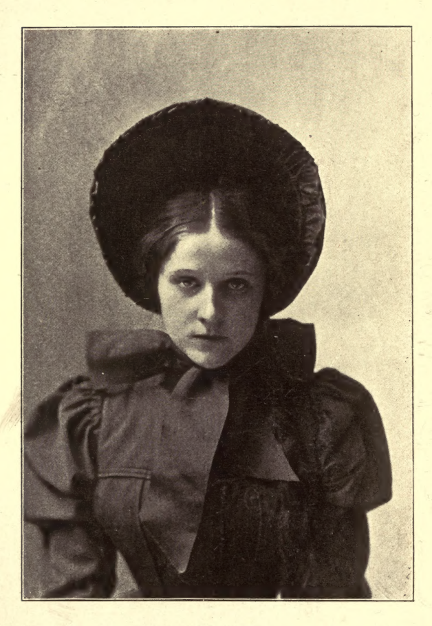
EDNA MAY As Violet Grey in "The Belle of New York."