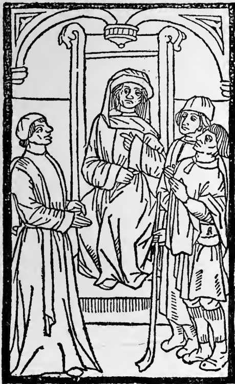
The court scene