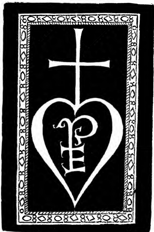
The emblem of Pierre Levet