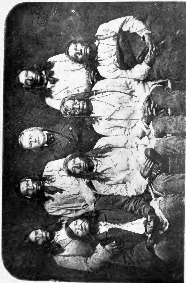
A DELEGATION OF INDIAN CHIEFS IN OREGON.