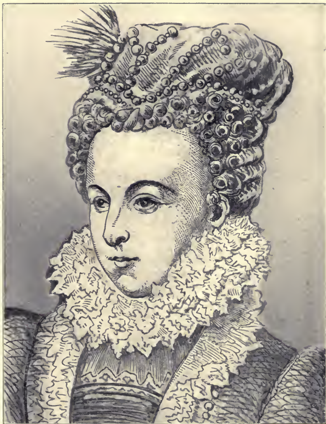
MARGUERITE DE VALOIS, QUEEN OF NAVARRE.