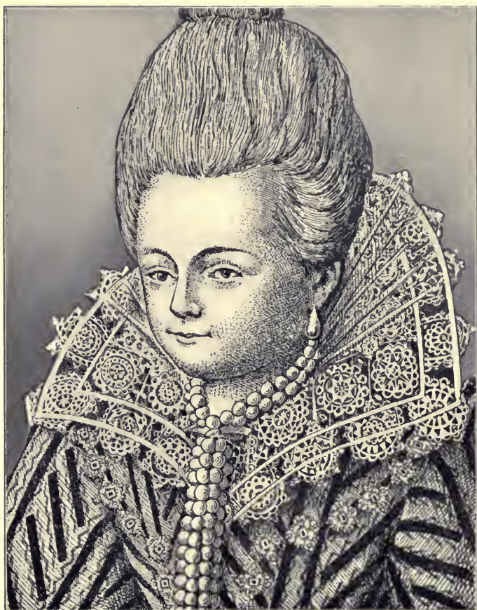
DIANE, COMTESSE DE GRAMONT, "LA BELLE CORISANDE."

After the Portrait in the Versailles Museum.