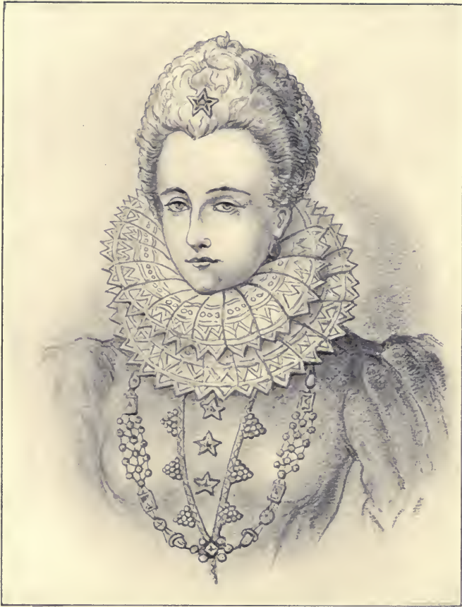
GABRIELLE D'ESTRÉES, "LA BELLE GABRIELLE."

After a contemporary Drawing in the Louvre Museum.