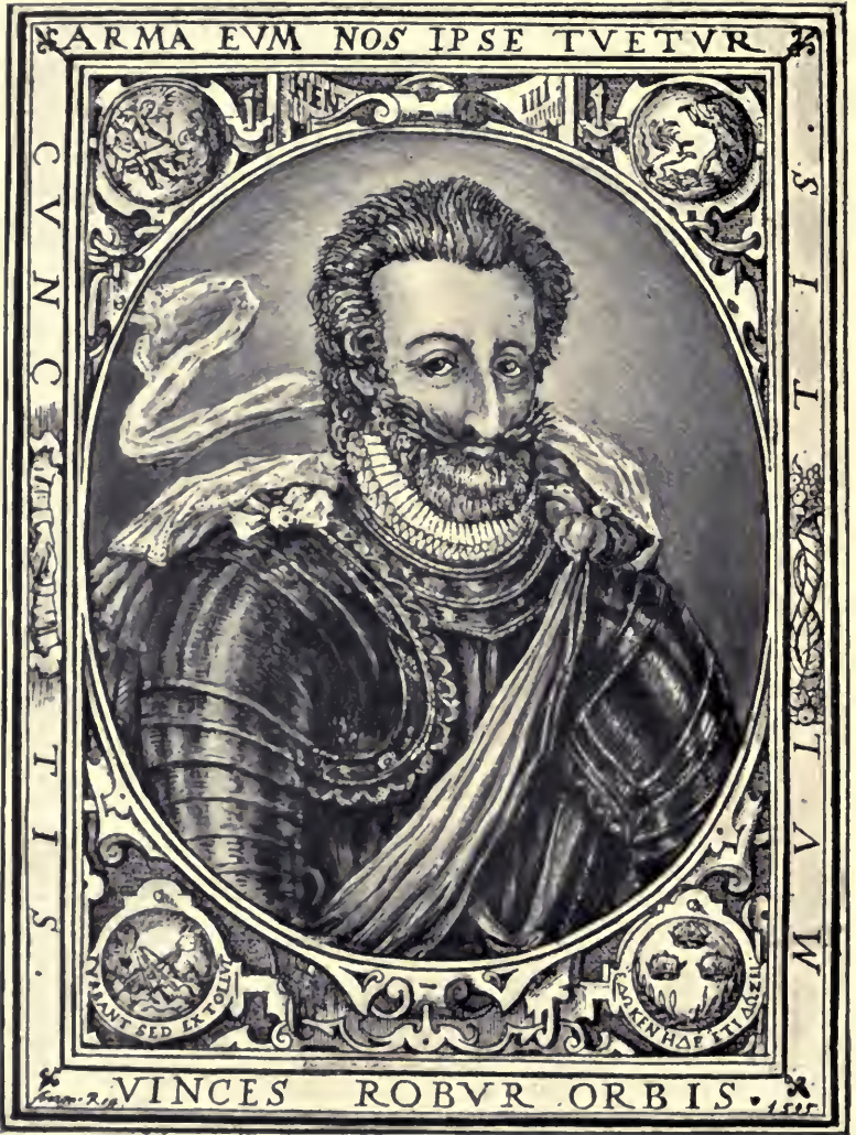
HENRY IV., KING OF FRANCE AND NAVARRE, IN 1595.