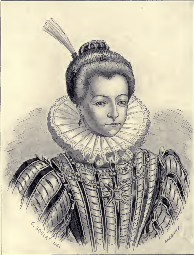
HENRIETTE D'ENTRAGUES, MARQUISE DE VERNEUIL.