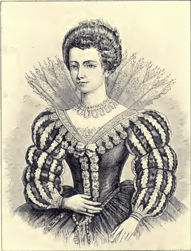
CHARLOTTE DE MONTMORENCY, PRINCESSE DE CONDÉ.

After the Portrait in Montfaucon's "Monuments de la Monarchie Française."