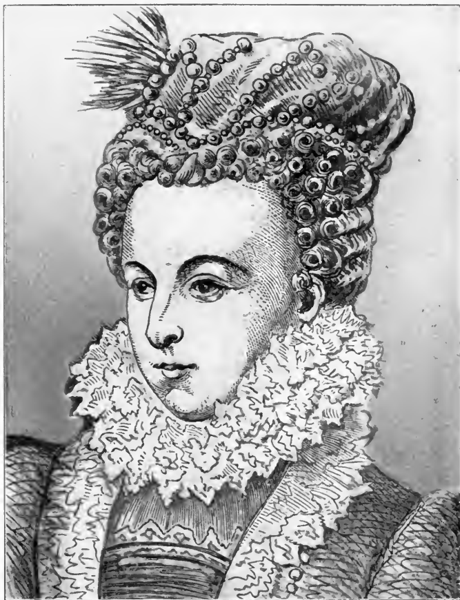
MARGUERITE DE VALOIS, QUEEN OF NAVARRE.