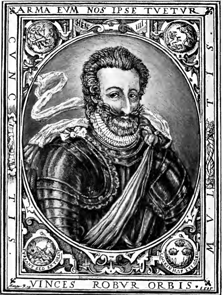
HENRY IV., KING OF FRANCE AND NAVARRE, IN 1595.