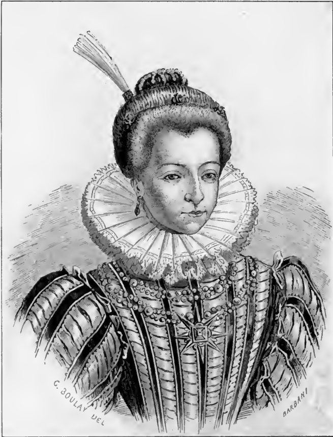
HENRIETTE D'ENTRAGUES, MARQUISE DE VERNEUIL.