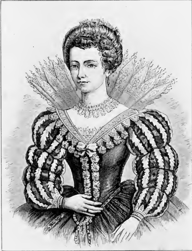
CHARLOTTE DE MONTMORENCY, PRINCESSE DE CONDÉ.

After the Portrait in Montfaucon's "Monuments de la Monarchie Française."