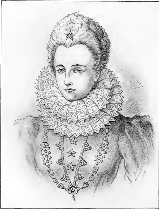
GABRIELLE D'ESTRÉES, "LA BELLE GABRIELLE."

After a contemporary Drawing in the Louvre Museum.