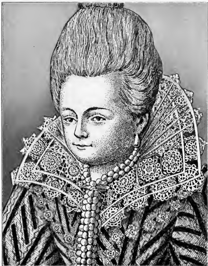
DIANE, COMTESSE DE GRAMONT, "LA BELLE CORISANDE."

After the Portrait in the Versailles Museum.