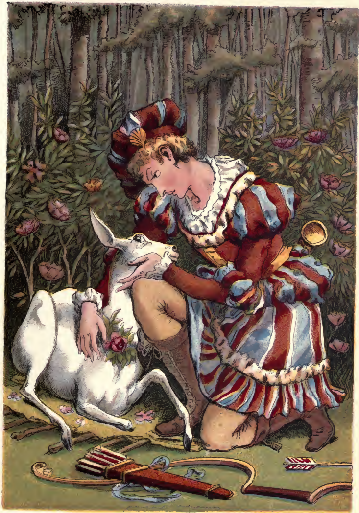
The Prince Captures the Fawn.

them around her leg; and then making her a soft bed of leaves, he went to look for Silvertongue, to assist him in getting the Fawn to the cottage. As soon as