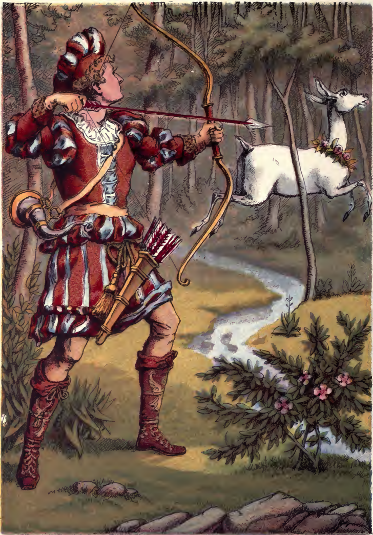
Prince Warrior Wounding the Fawn.

of fear and pain in her soft eyes, his heart was moved to pity; and he was sorry for what he had done. He caressed her tenderly, and gathering some herbs, bound