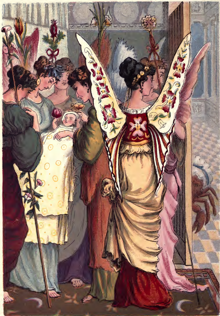
Threat of the Fairy Crab.

you to my sisters; you have called them , and neglected me ." The Queen asked her pardon for the oversight, and her sister fairies joined their prayers to hers, but in vain.