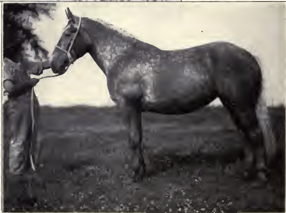
ILLINI ADA 176090 Grey