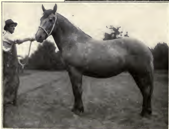
ILLINI JULIET 176091 Grey