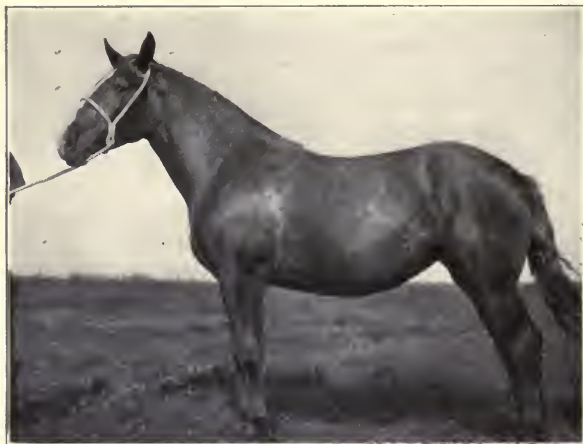
ILLINI ELLA 175918 Grey