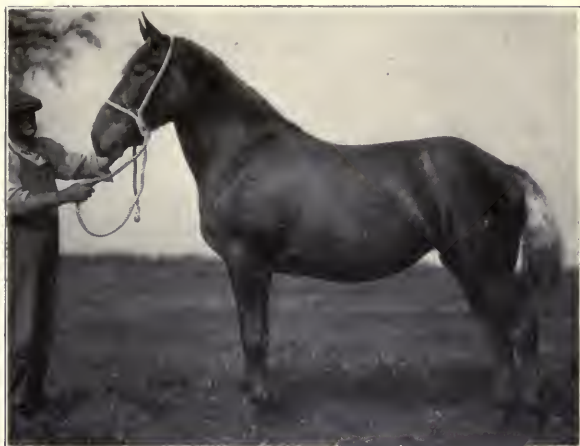
ILLINI IDA 175919 Grey