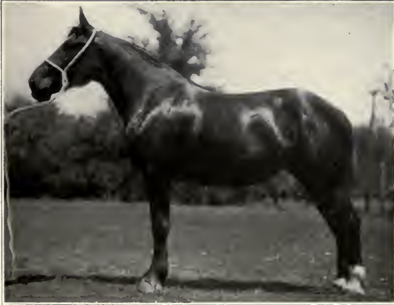
HILDEFONSE 175672 Black