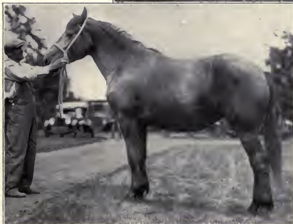
ILLINI JUNO 175920 Grey