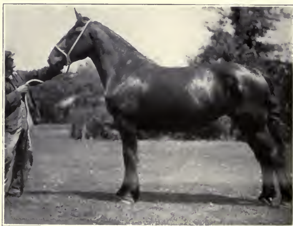
GENILFONSE, 174198, Grey

As is always the case, the pasture proved to be a very important factor in the development of the fillies. In order to maintain satisfactory gains, it was found necessary to feed some grain with sweet-clover pasture. To feed grain in this way is more economical and safer than to let colts get thin on pasture and then attempt to put them in condition