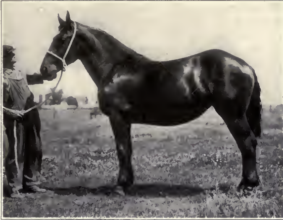
BONNIE DECIME 175585 Black