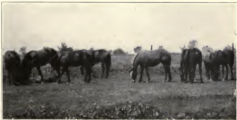
THE FILLIES AS YEARLINGS

In the table on the following page will be found a summary of the data of all four experiments. A brief statement of the results was made in the introductory paragraphs on page 247; the figures are included here in order that the reader may make any comparison he may wish of the more important features of the experiments.