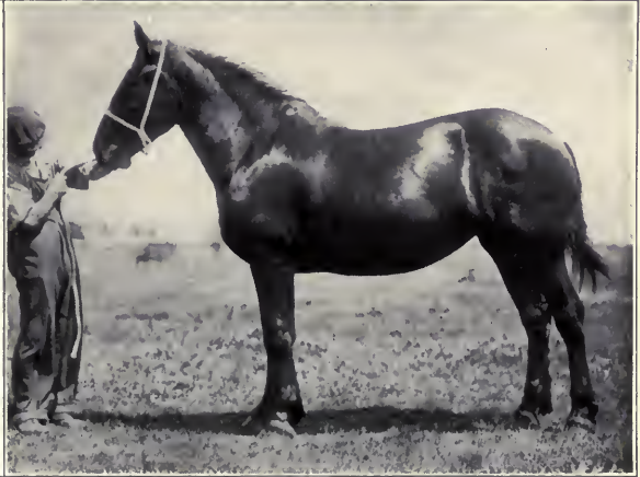
LENORA 175698 Grey