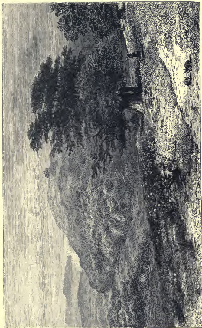
AMONG THE CHALK DOWNS. ST. MARTHA'S CHAPEL, FROM NEWLAND'S CORNER.