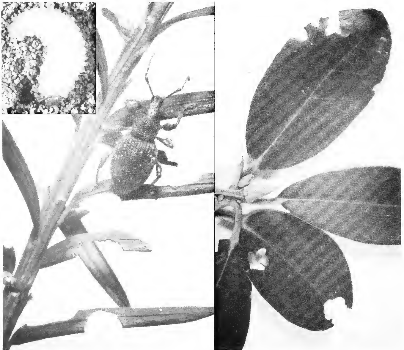
Figure 1—Adult of black vine weevil feeding on foliage of T. cuspidata (left) and larva (inset); (right) characteristic feeding damage on R. catawbiense .

'Densa' (45 cm diam. canopy), heavily infested with larvae, were transplanted into a field of five rows of 10 plots in Windsor, Connecticut. Each plot contained four plants. Plants were placed 0.6 m apart within plots, and the plots were spaced 1.5 and 2.1 m apart within and between rows, respectively. Each four plant plot was surrounded by a barrier constructed from aluminum lawn edging (15 cm wide) coated with Floun (a slippery material that stops insects from climbing) to prevent adult weevils from moving between plots. The barrier was imbedded in the soil so that