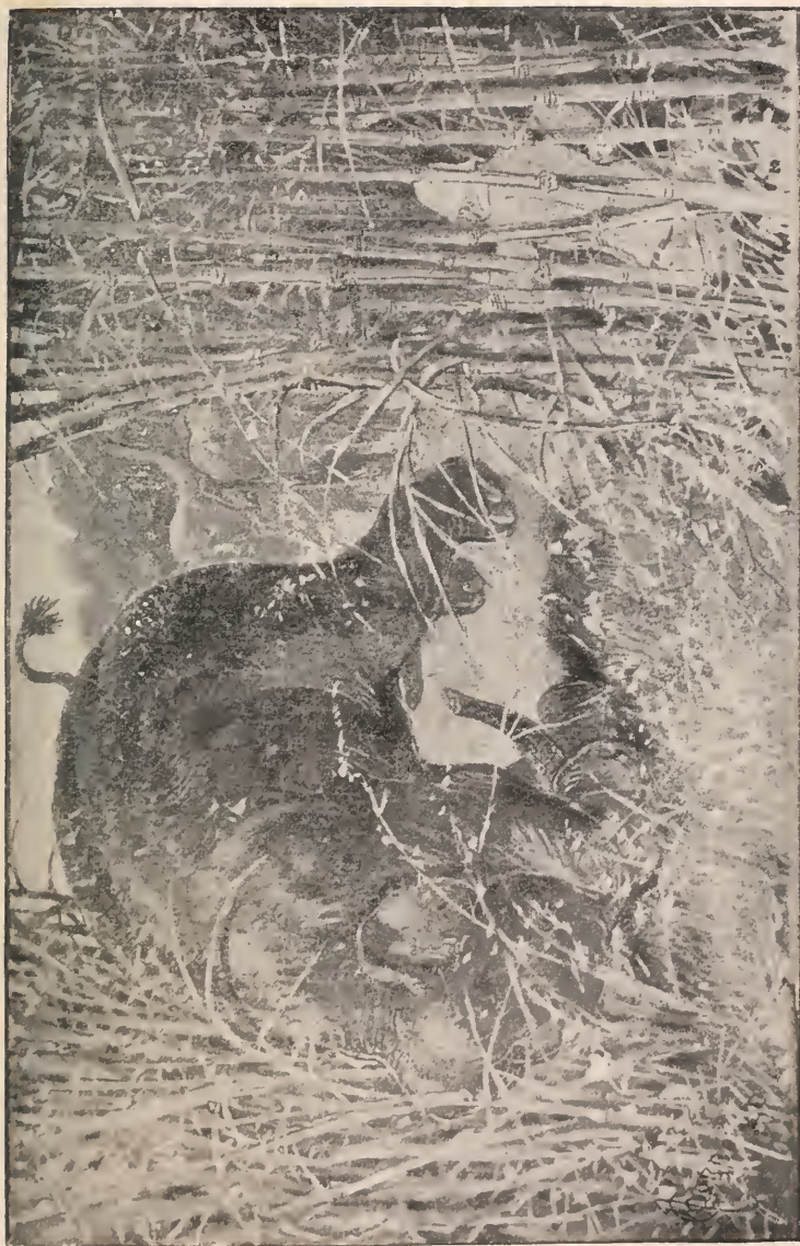
"Fell head foremost into a clump of bamboos."