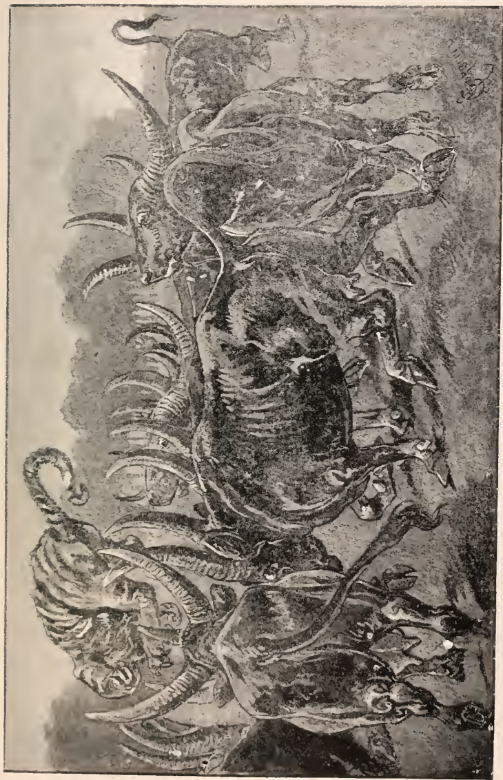
"I saw a brindled mass thrown high up."