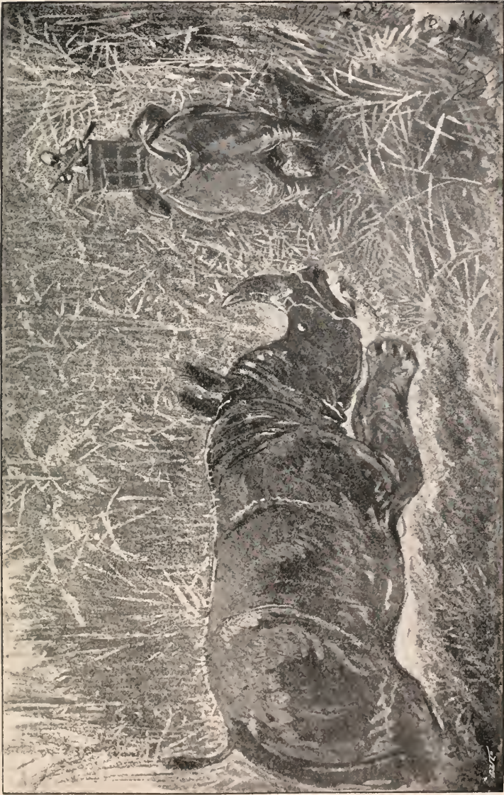
"B.'s elephant did not wait, but bolted through the long grass."