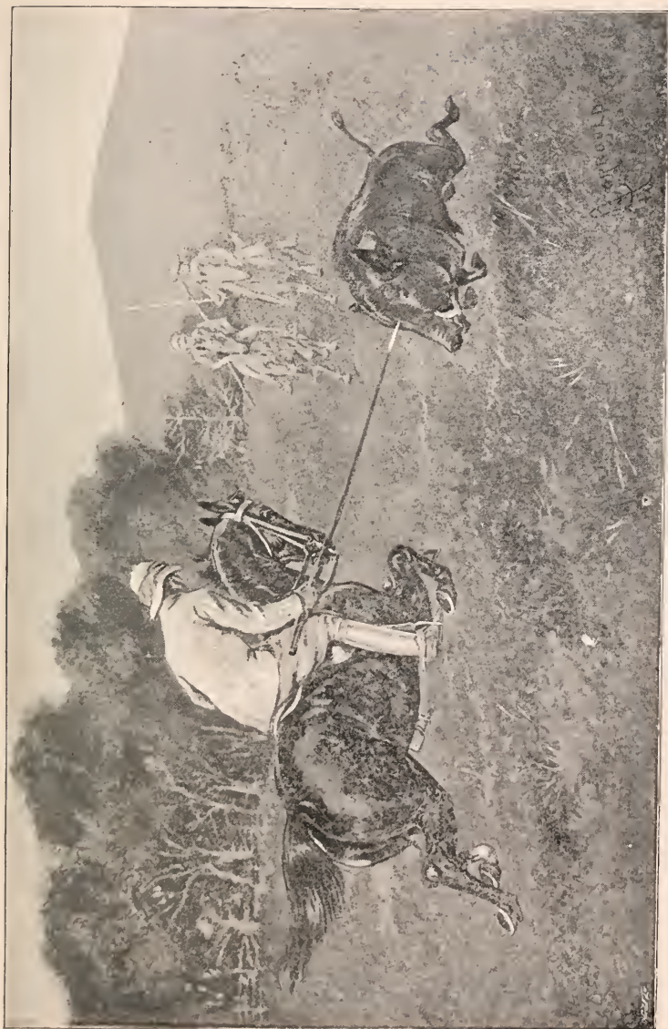
"My spear went through his brain, and he died."