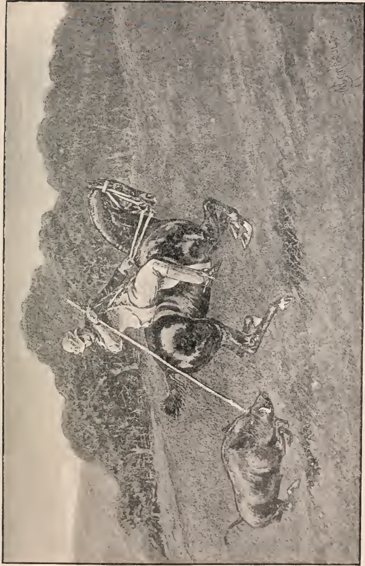
"Turning round in the saddle with a backward prod I stabbed the bear."