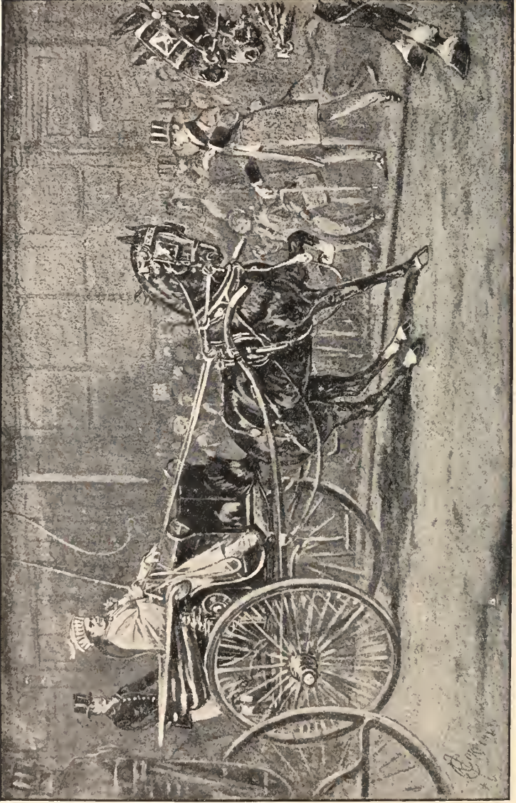
“Directly he saw me he pulled up sharp.”