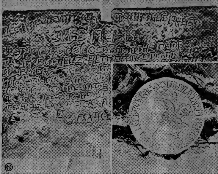
THE COIN FITS. Notice how an Elizabethan sixpence fits the hole in the Drake plate, helping prove its authenticity.

NEW YORK.—“Sir Francis Drake’s Brass Plate” has passed six stiff chemical tests and graduated into secure position as an authentic American history document. Lively controversy as to genuineness of the plate followed its discovery on the California coast by a picnicker in 1936.