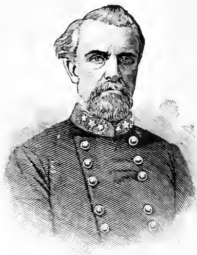
NATHAN BEDFORD FORREST.

This distinguished cavalry officer was born of humble parentage in Bedford county, Tennessee, on July 13th, 1821. He had no advantages of education, and his youth was spent on farms in his native State and in Mississippi.