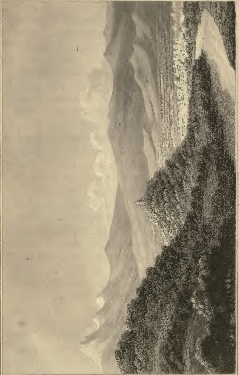
London, Published by T. Murray, 1819.