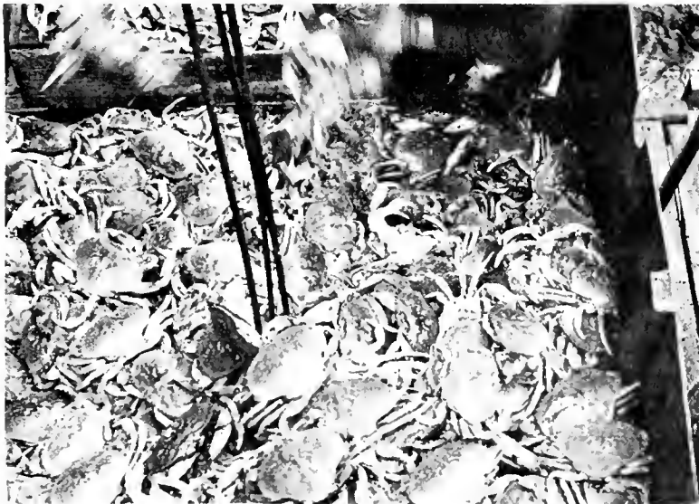
Figure 3 - Live crabs in holding tank ready for unloading at shore plant.

Crabs are delivered alive to shore plants, generally located on docks convenient to unloading facilities (fig. 3). Crabs must be kept alive until they are processed. Large crabs with the claws and legs intact are generally processed whole for the fresh-market trade. Crabs without legs or claws are processed for picking, and the meat is marketed fresh, frozen, or canned.