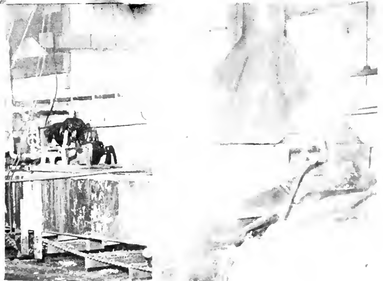
Figure 6 - A steam-heated cooking chamber.

If the crabs are thoroughly bled and cleaned, there is less chance that blood residues will cause undesirable color changes in the flesh during the cooking. The crabs are next broken into two sections which are carried on a conveyor belt through a cooking chamber containing water at 210° to 212° F., or steam at 212° to 220° F. (fig. 6).