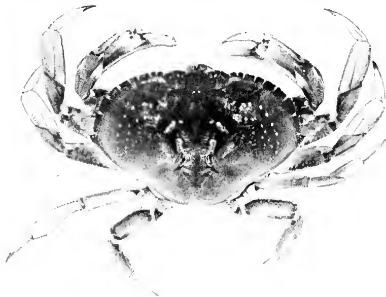
Figure 1 - Dungeness Crab

The Dungeness crab ( Cancer magister ), often called the Pacific crab, is a large hard-shell crab measuring up to 10 inches across the carapace (fig. 1). It is named after a small fishing village, on the Strait of Juan de Fuca in Washington, where the commercial fishing for this crab began. The Dungeness crab, in its several market forms, is considered a choice fishery product of the North Pacific Coast and provides a highly palatable protein-rich food.