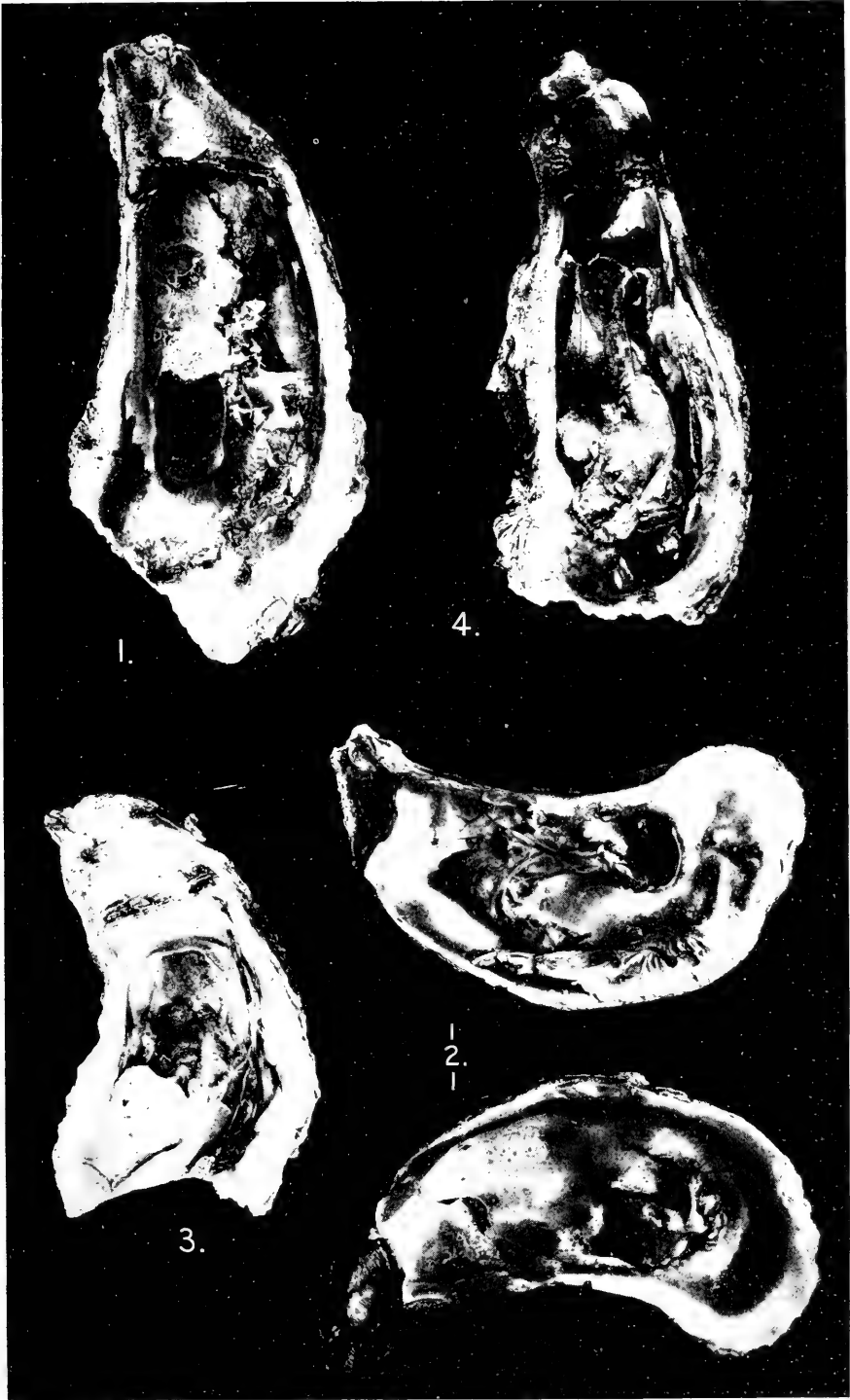
OYSTERS AND SHELLS, SHOWING THE RESULTS OF ATTACK BY FLATWORMS.