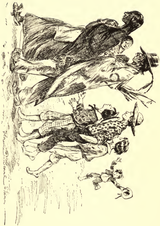
"REAL INDIANS, IN BLANKETS, WITH BOWS AND ARROWS"