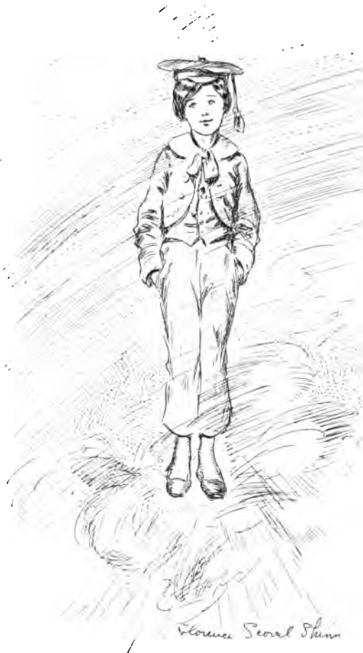
“ VERY SMILING-LOOKING ”