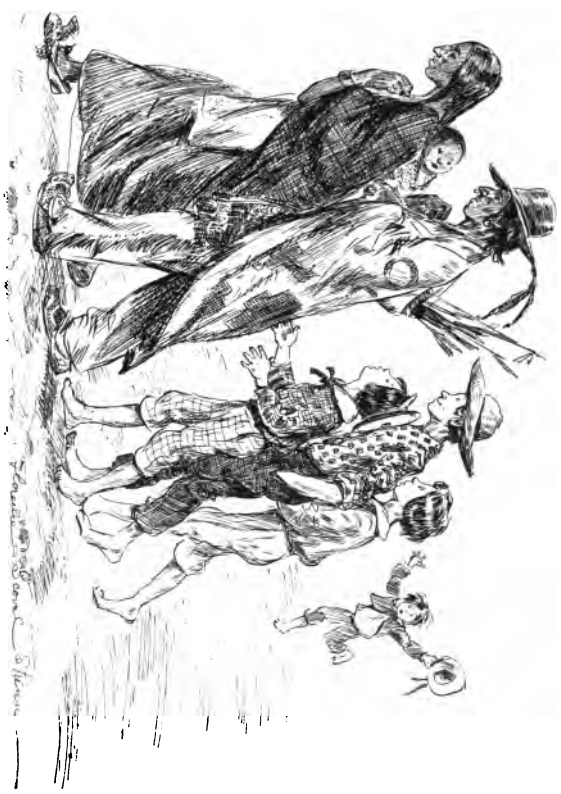
“ REAL INDIANS, IN BLANKETS, WITH BOWS AND ARROWS ”