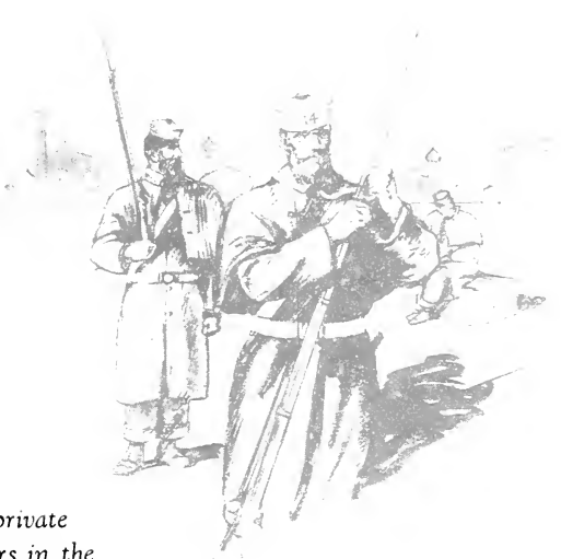
British private soldiers in the Crimean War

Once she ordered a government consignment to be opened forcibly while the Purveyor stood by wringing his hands in fear of what the Board would say. Sometimes she got the Board together herself and forced it to "sit" on supplies which were needed at once. She did not take the report of others as to what was in the storehouse, but went foraging there herself.