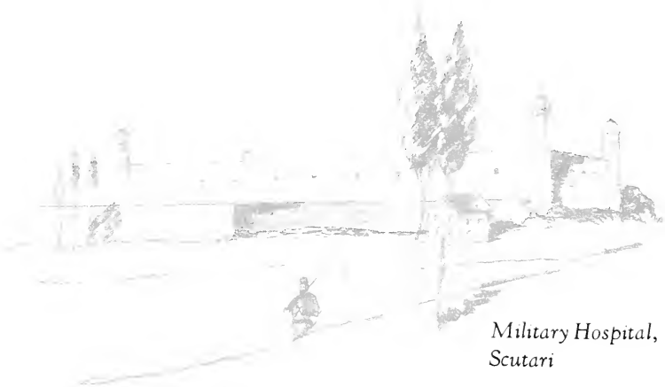
Military Hospital, Scutari

she found "The sanitary conditions of the hospitals of Scutari were inferior in point of crowding, ventilation, drainage, and cleanliness to any civil hospital, or to the poorest homes in the worst parts of the civil population of any large town that I have seen." Ordinary comforts for the sick and wounded were lacking and necessary surgical and medical supplies were often not forthcoming. There were not enough beds, "there were no vessels for