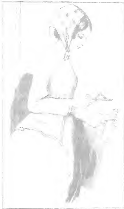
The Lady of the Lamp

Six months after FLORENCE NIGHTINGALE's arrival, the results of her activity were clearly apparent. Order and cleanliness reigned in the wards. The hospitals were better supplied. Sanitary improvements, so important that FLORENCE NIGHTINGALE said they had saved the British Army, had been carried out. Most remarkable of all, the death rate among the cases treated had fallen progressively from 420 a thousand in February, 1855, to twenty-two a thousand in June, 1855.