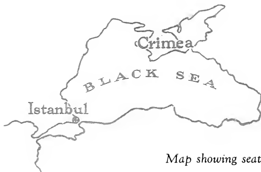
Map showing seat of war