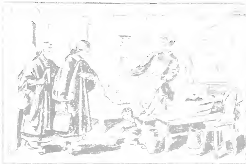
The Kaiserwerth Training School, Germany

are ducks and have hatched a wild swan."