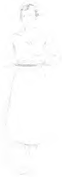
A modern nurse

It was not FLORENCE NIGHTINGALE'S desire that the nurses trained in her school should do private nursing. Her nurses, when they had finished their training, were expected to take positions in hospitals, workhouses, poorhouses, and other similar institutions. In this way she thought that her training school would be, in turn, the means of training elsewhere. It was. The profession of trained nursing, with its high standards and with the expansion into the great field of public health nursing, has grown from that beginning.