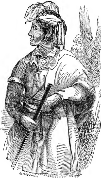
Coacoochen, (Wild Cat.)