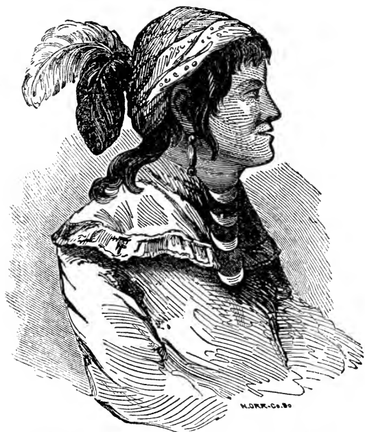
As-se-he-ho-lar. (known as Osceola, or Powell.)