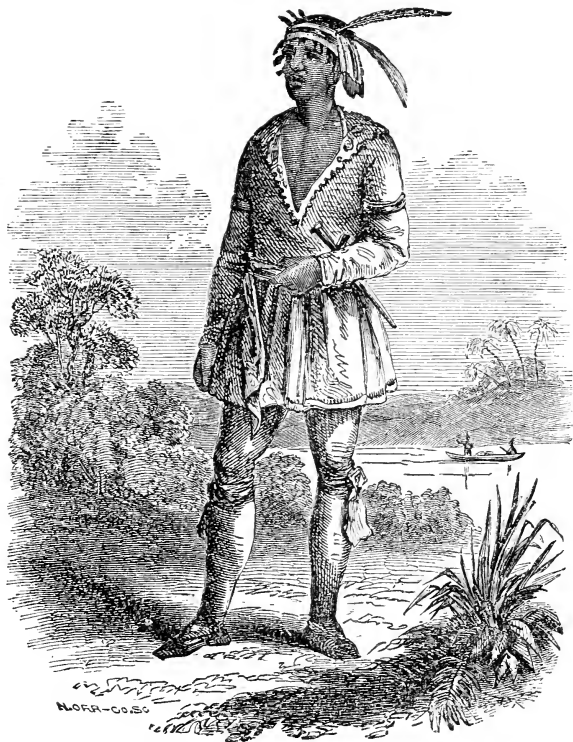
Gopher John, Seminole Interpreter.