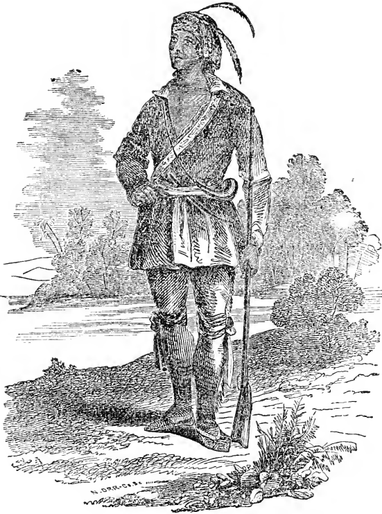
Thlocklo Tustenuggee, (Tiger Tail)