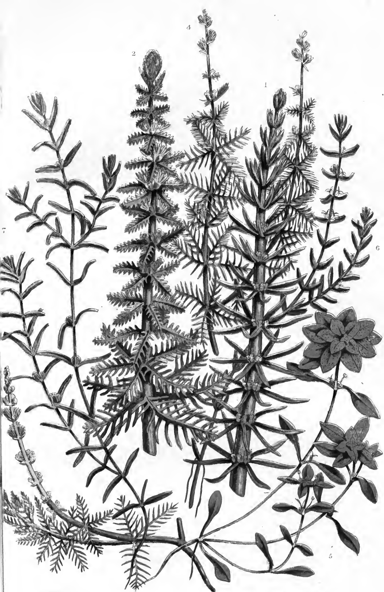
1. Alternanthera versicolor W. M. 2. Alternanthera versicolor W. M. 3. Alternanthera versicolor W. M. 4. Alternanthera versicolor W. M. 5. Alternanthera versicolor W. M. 6. Alternanthera versicolor W. M. 7. Alternanthera versicolor W. M.