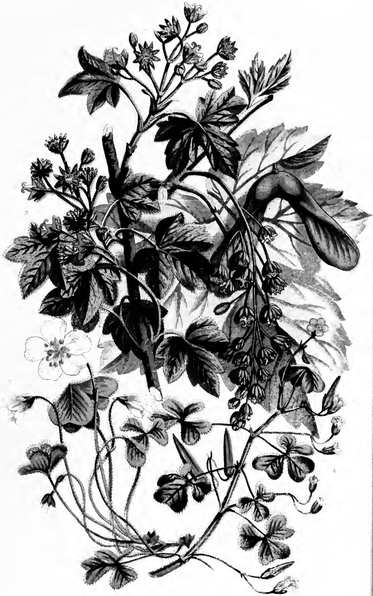
Phaseolus vulgaris L. (Common Bean) 1. Flower. 2. Seed pod. 3. Leaf. 4. Root. 5. Stem. 6. Pod. 7. Seed.