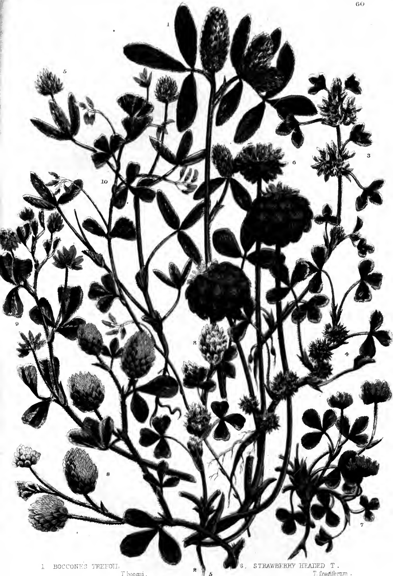
1. BOCCONE'S TREFOIL.