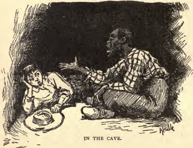
IN THE CAVE.

Special edition of the above books, fully illustrated and handsomely bound, sold separately: