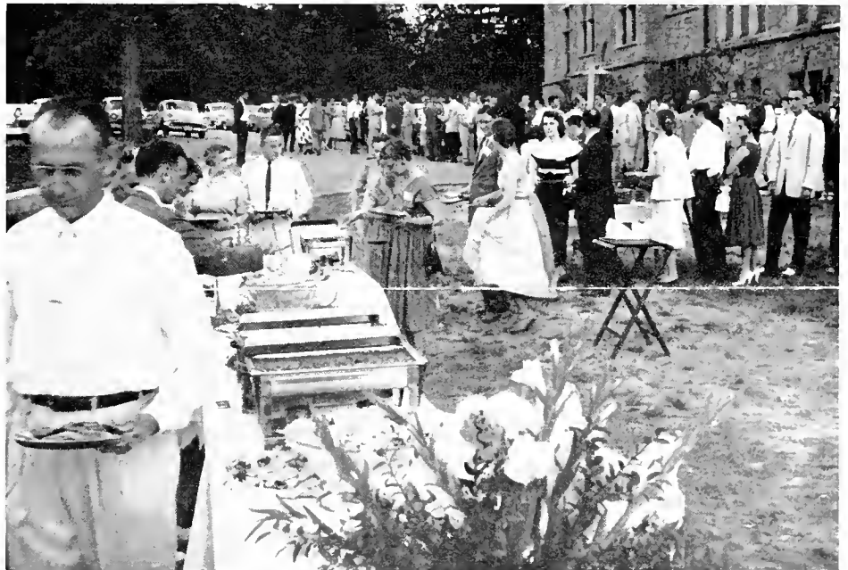
Alumni, guests and faculty line up for smorgasbord dinner.