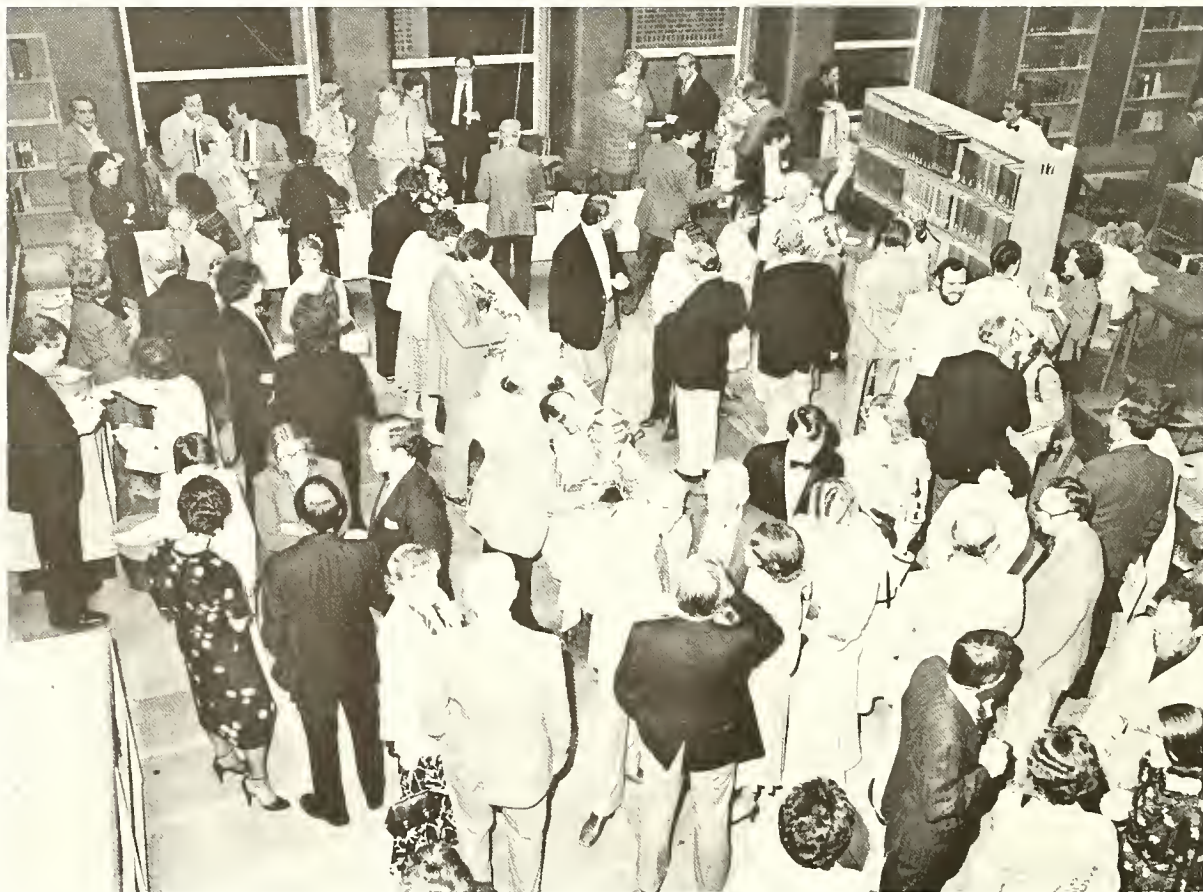
Over three hundred people came to the party to visit with the writers, watch the door prize drawing, and sample the refreshments laid out in the reference reading room.