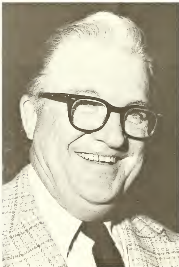
Writer John Graves also attended the party.