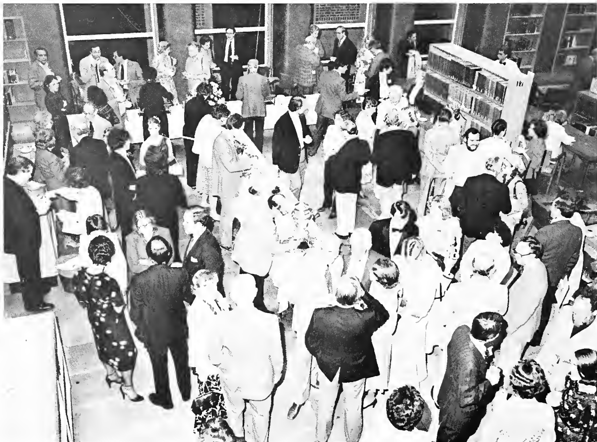
Over three hundred people came to the party to visit with the writers, watch the door prize drawing, and sample the refreshments laid out in the reference reading room.