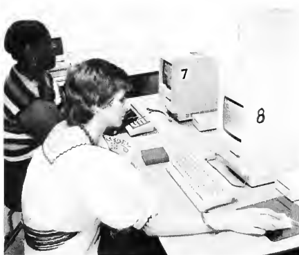
Staff member and patron at Mac terminals in the CSI.

In the past, libraries and computer centers have often been perceived as aloof and forbidding institutions. Today, as they become linked conceptually and functionally, that attitude is changing. Both kinds of facilities are becoming more service-oriented, and more attention is being paid to their patrons. New centers like the CRA and the CSI will help people learn about and gain access to the new information technologies that have come to be an integral part of intellectual endeavor. ☸