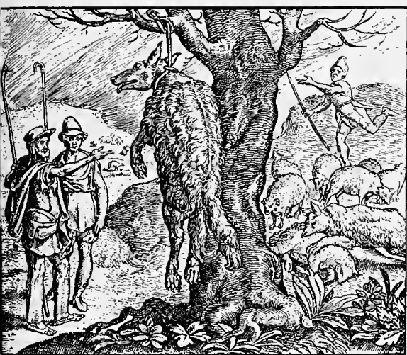
The Hanging Wolf in Sheep's Clothing, an engraving by Marcus Gerards from Vondel's Royal Zoo.

In 1625 Vondel achieved notoriety when his tragedy Palamedes oft Vermoorde Onmooselheyd ( Palamedes, or Murdered Innocence ) got him into serious trouble with the Calvinist authorities.