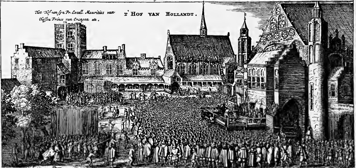
The beheading of the seventy-two-year-old statesman Johan van Oldenbarnevelt, May 13, 1619, on the Binnenhof at The Hague. This event becomes the thinly disguised subject of Vondel's 1625 drama Palamedes, or Murdered Innocence . Engraving by Claes Jansz. Visscher.

AFBEELDING DER IUSTITIE GESCHIED DEN XIII MAY 1619 AEN IAN VAN OLDENBARNEVELT GEWESENE ADVOCAET VAN HOLLANT