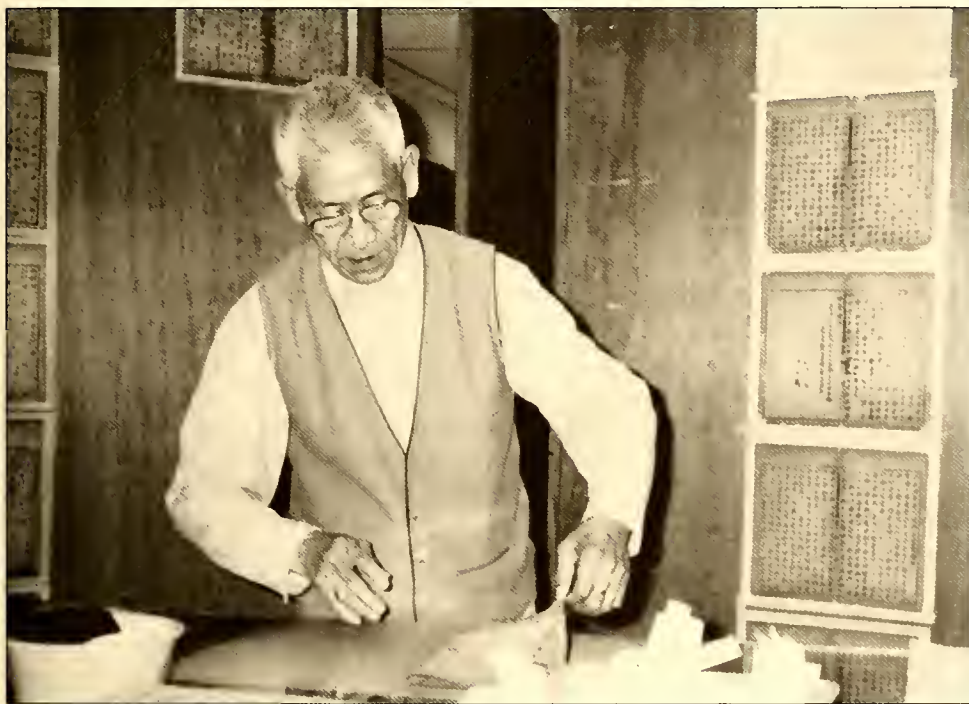
Restoration work in Taiwan may involve working with scrolls 2,000 years old, or more. NCL also has preserved materials written on bark.

Fortunately, she found the library’s organiza-