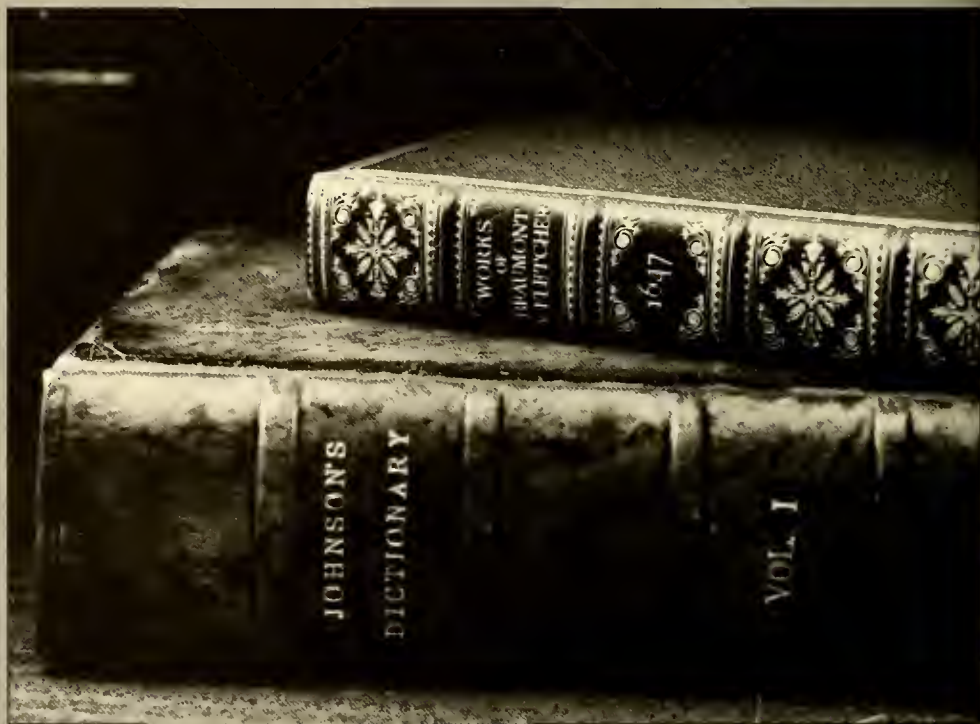
Rare and significant volumes have enhanced the library's special collections.