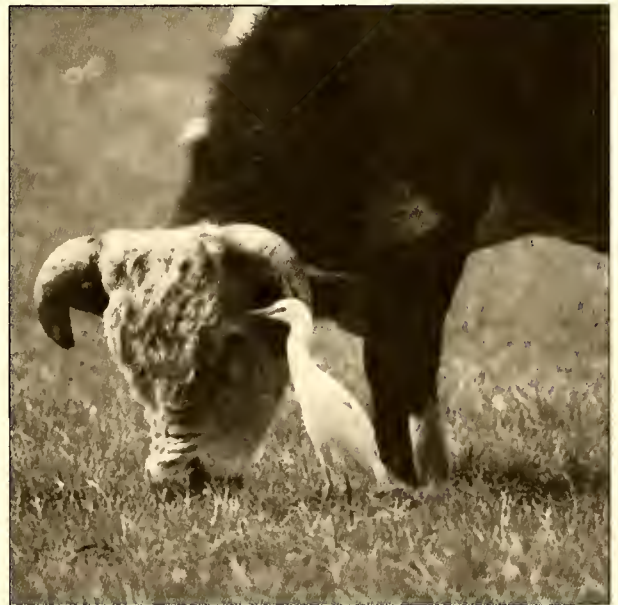
The cattle egret is often found in pastures with grazing cattle.

"Birdwatching does not have to be a big production...let birds happen to you," Robison says. "(T)hey are the natural soul of the urban landscape. They enhance the city and the lives of