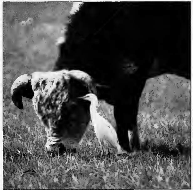
The cattle egret is often found in pastures with grazing cattle.

"Birdwatching does not have to be a big production... let birds happen to you," Robison says. "(T)hey are the natural soul of the urban landscape. They enhance the city and the lives of