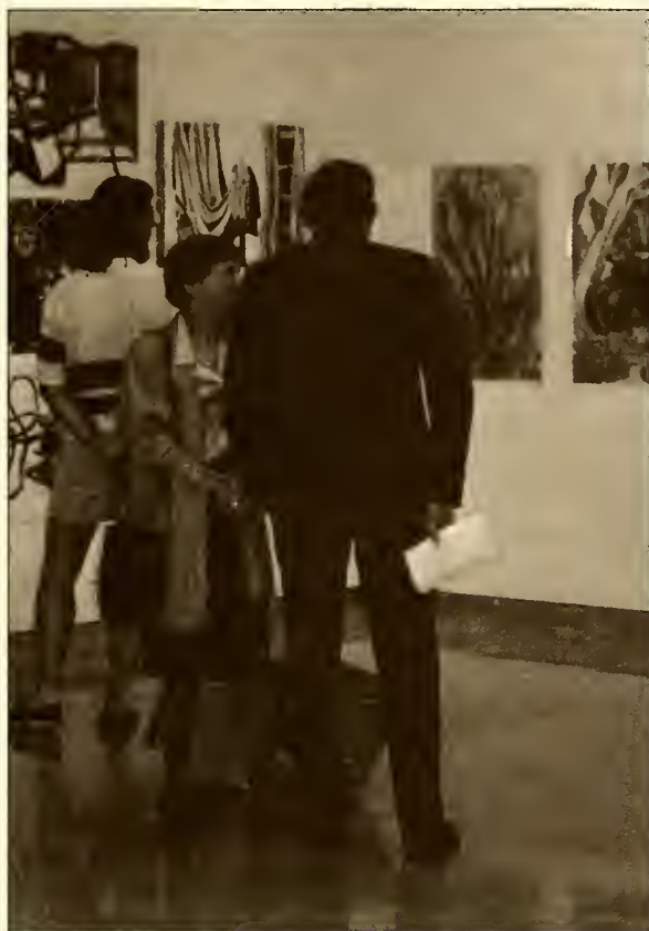
The Preview of Student Art Exhibition will be held Thursday, April 16 at Sewall Art Gallery.

A student art exhibition preview will be held Thursday, April 16, 6-8:30 p.m. at Rice's Sewall Art Gallery. The event is co-sponsored by the Friends of Fondren Library and the Arts Committee of the Association of Alumni.