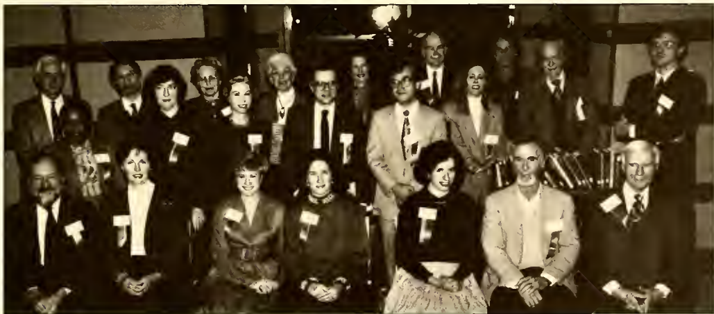
Rice-affiliated authors were honored at a reception in January.

A Rice poet and faculty member recently recalled the story of a former student, traveling by plane, who was asked about her fiancé's occupation. On learning he was a poet, the questioner expressed surprise: "Oh! I didn't realize there were any living poets!"