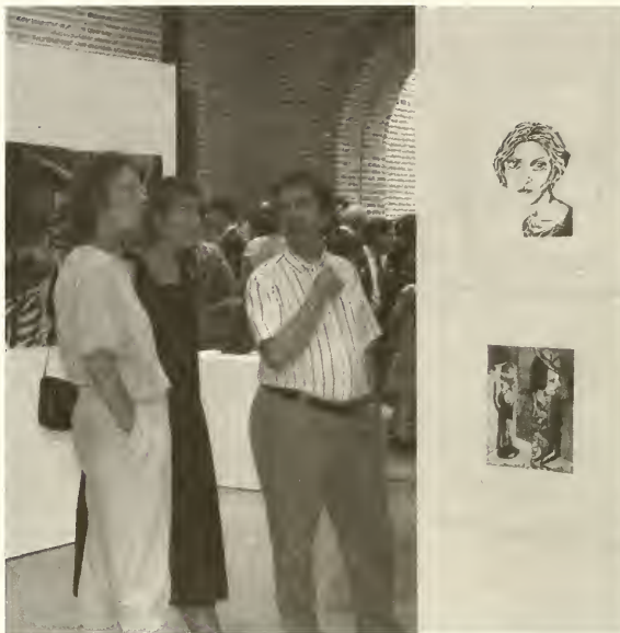
1992 Student Art Preview