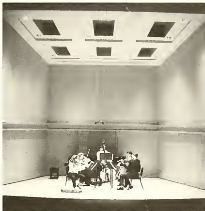
Shepherd School students performed at the Eleventh Annual Schubertiad.