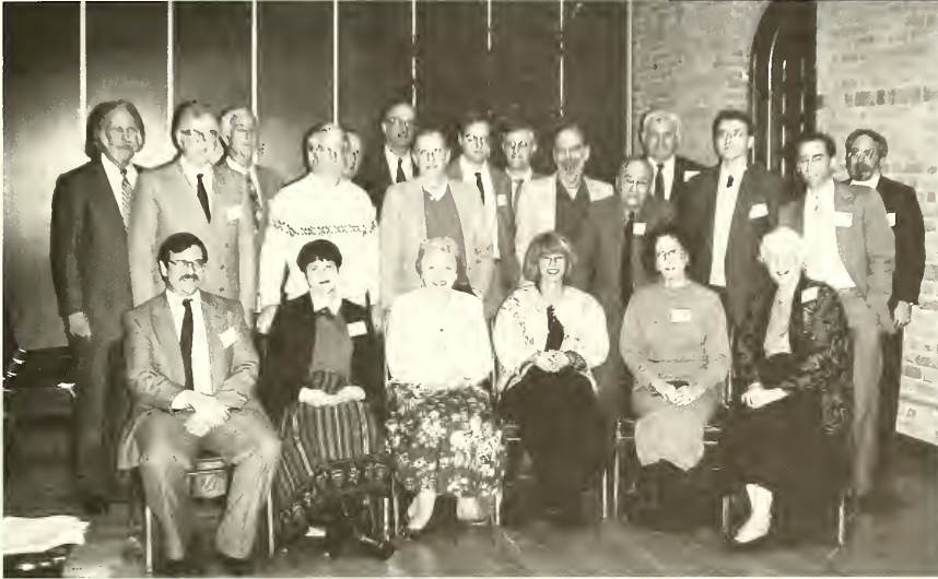
Rice-affiliated authors were honored at a reception in January