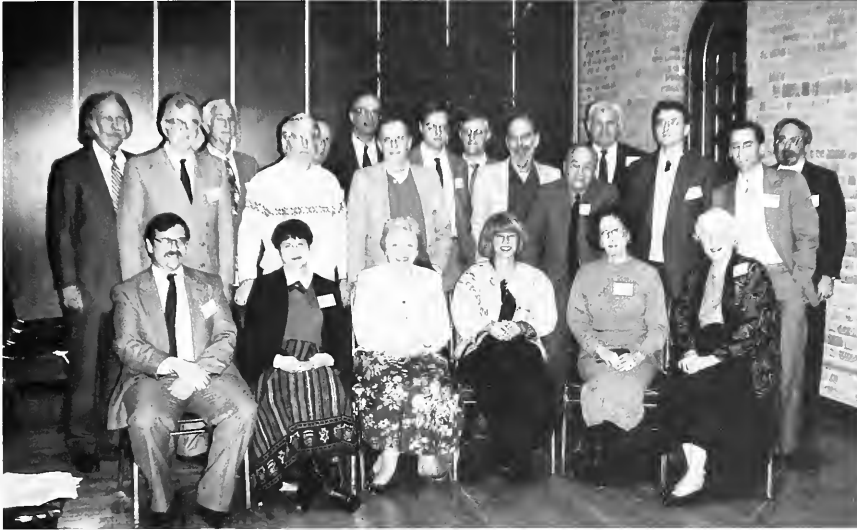
Rice-affiliated authors were honored at a reception in January