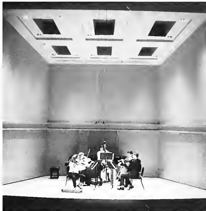
Shepherd School students performed at the Eleventh Annual Schubertiad.