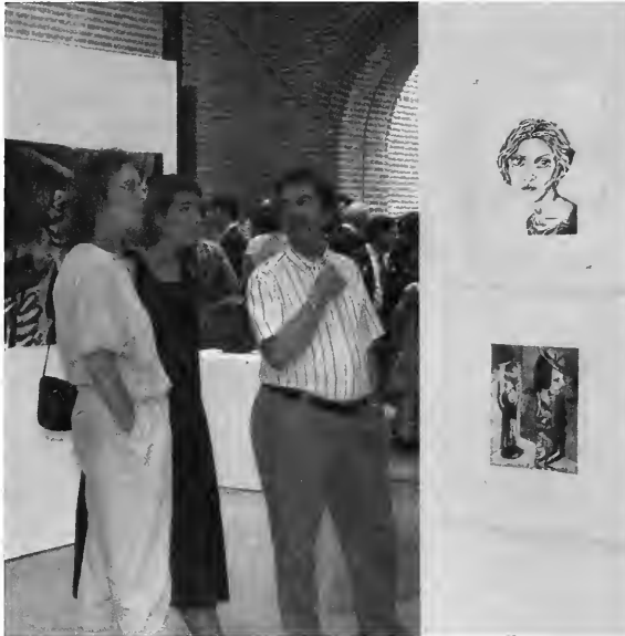
1992 Student Art Preview