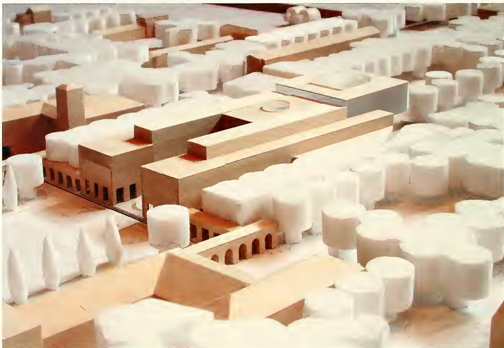
Architect's model of the new library in its setting on the Rice Campus