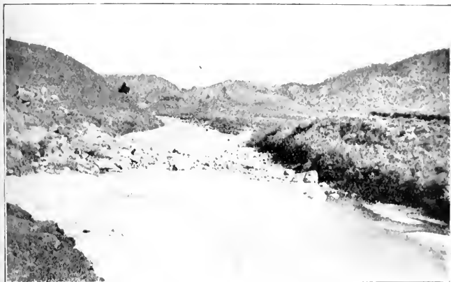
THE REPUTED HAUNT OF U KSUID TYNJANG.

To lure people into his grasp, he used to imitate the human voice and to shout " Kaw-hoit, Kaw-hoit! " the common signal-cry of people who lose their companions or their way—a cry to which all humane travellers