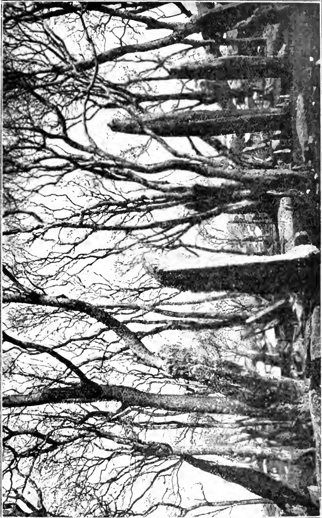
SACRED GROVE AND MONOLITHS.