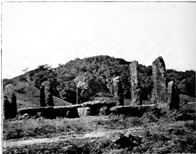
A VIEW IN THE REPUTED REGION WHERE U RAMBAH THE GIANT COMMITTED HIS ATROCITIES.

In the course of time they took to themselves wives and became the heads of families. U Riwbha's wife, like himself, belonged to one of the wealthy families, so that by his marriage his influence in the village increased, and he became very rich and prosperous. U Baduk also married into his own class and went to live in a distant