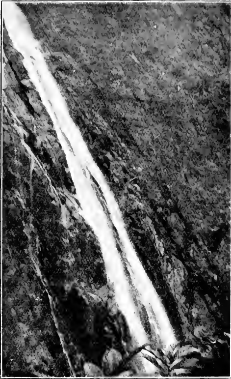
A KHASI WATERFALL IN THE NEIGHBOURHOOD OF THE MOUNTAIN OF THE IEI TREE.

The Iei Tree continued to grow through many ages, and year by year its malevolent shadow spread further