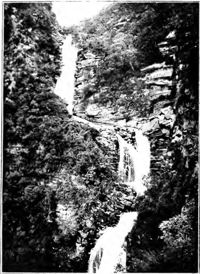
IN THE NEIGHBOURHOOD OF THE MOUNTAIN OF THE 161 TREE.