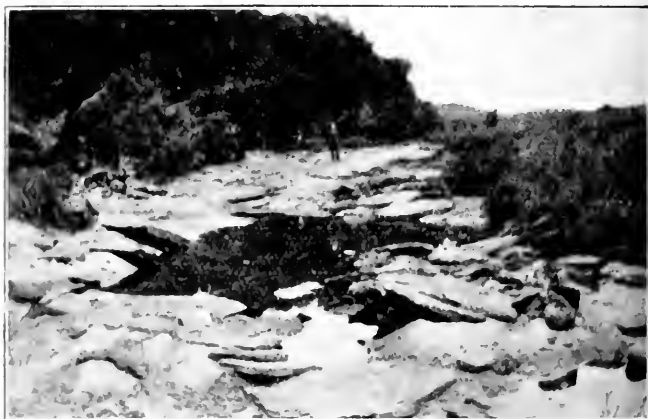
THE HAUNT OF KA KMA KHARAI.

When it was discovered that she was with child, she fled from her home, fearing the wrath of her father, and put herself under the protection of her maternal uncle, who lived in the Pomdoloï cave, and was one of the famous dragons, or Yak Jakors of the country.