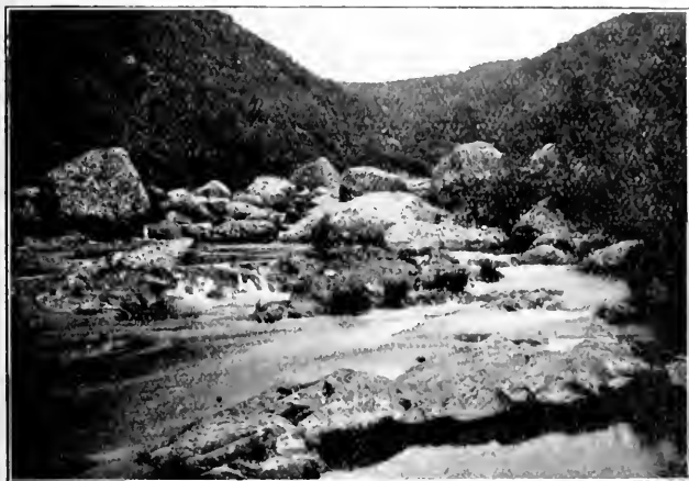
AT THE FOOT OF MOUNT SHILLONG.

so the people began to call him "U 'Lei Shillong" (the god of U Shillong) after the name of the man who first paid him homage. Then gradually he came to be called "the god Shillong," and in time the mountain itself was called the mountain of Shillong, and from this is derived the name of the present town of Shillong.