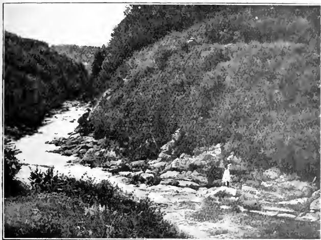
AT THE FOOT OF THE SHILLONG MOUNTAINS.

dise, but the dog, being of an indolent nature, did not like to work, though he was very desirous to go to the fair. So, to avoid the censure of his neighbours and the punishment of the governor of the fair, he set out in search of something he could get without much labour to himself. He trudged about the country all day, inquiring at many villages, but when evening-time