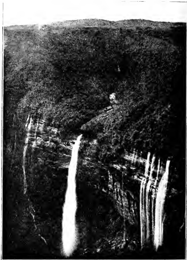
THE LEAP OF KA LIAL.