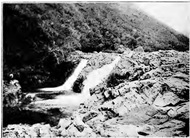
AT THE FOOT OF THE MOUNTAIN OF THE IEI TREE.

On the summit of the mountain there grew a tree of fabulous dimensions—the Iei Tree—which dwarfed even the largest trees in forests. It was of a species unique, such as mankind had never known; its thick outspreading branches were so clustered with leaves that