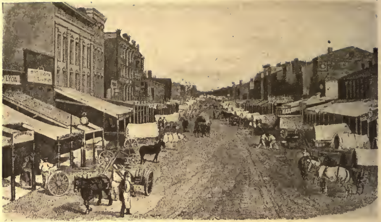
The Broadway, St. Louis, 1853

has acquired the manners and adapted herself to the usages of the white race with singular facility. Their children have been sent to the States to be educated in our best schools.