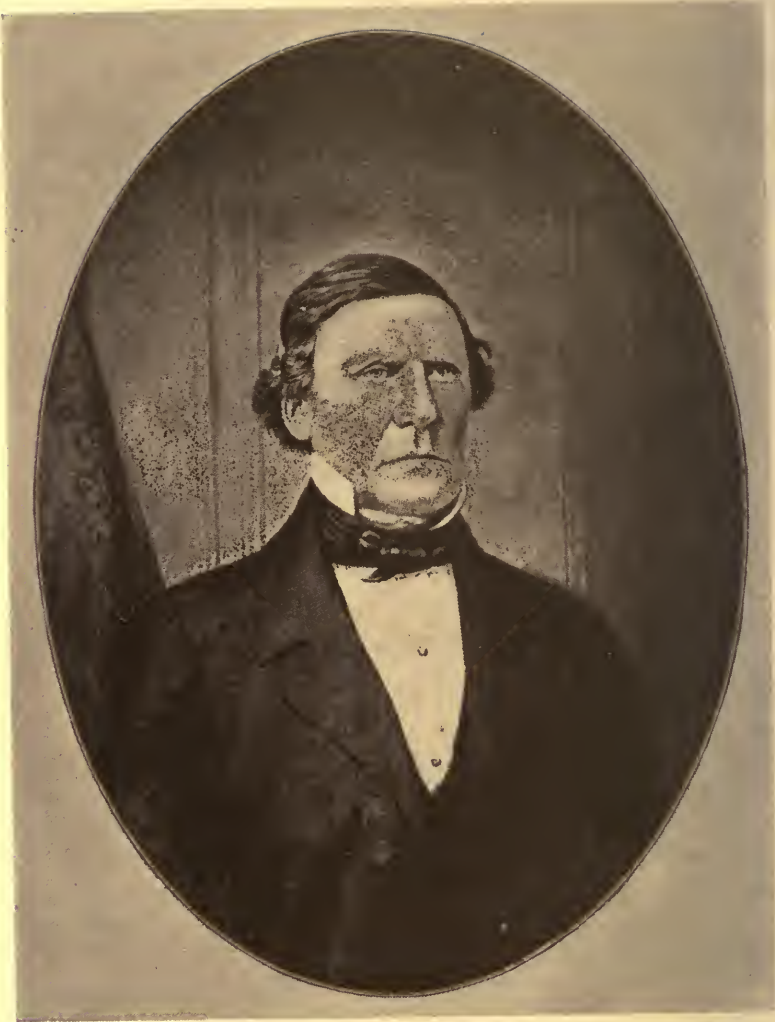
Kenneth McKenzie, Founder of Fort Union