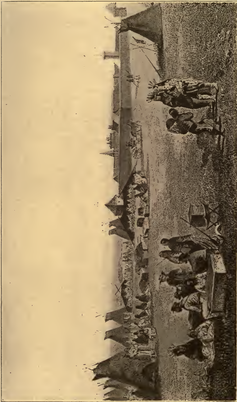
Reproduced from illustration in report of Isaac I. Stevens on Pacific Railway Exploring Ex- pedition of 1858. Original drawing by Stanley.