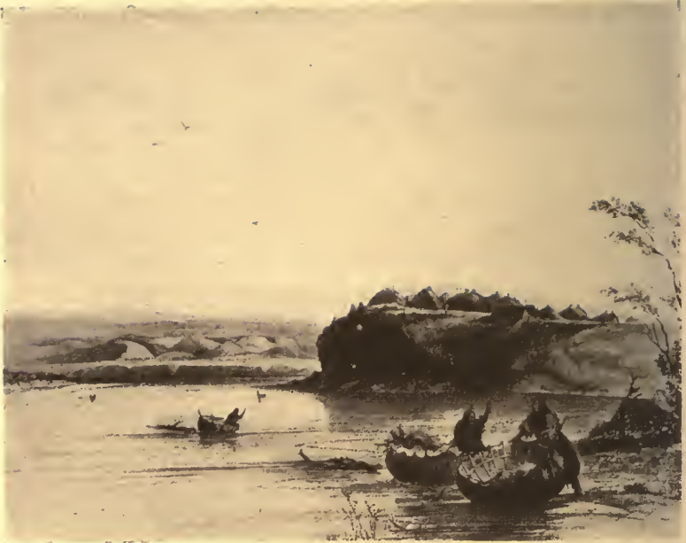
Reproduced from Maximilian, Prince of Wied Indian Bull-Boat