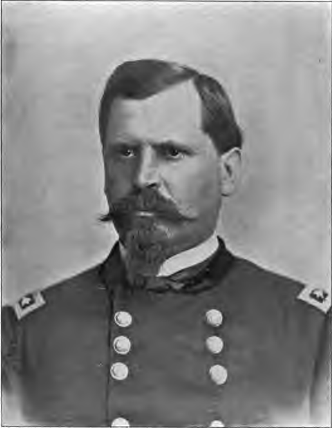
WILLIAM B. HAZEN.

Captain 8th Infantry, U. S. A.; Colonel 41st O. V. I.; Brig. Gen. U. S. Vols.; Maj. Gen. U. S. Vols.; Colonel 37th Infantry, U. S. A. Brigadier General U. S. A.