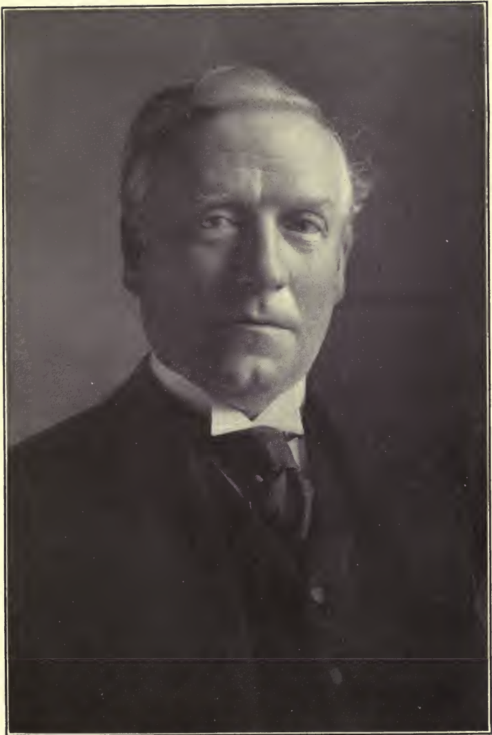
HERBERT HENRY ASQUITH