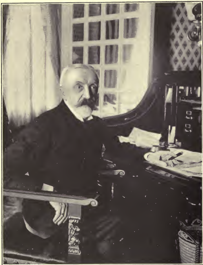
BARON ROMANOVITCH ROSEN