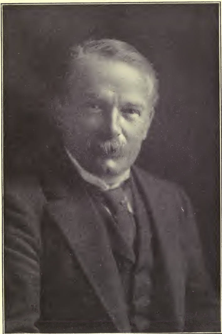
DAVID LLOYD GEORGE