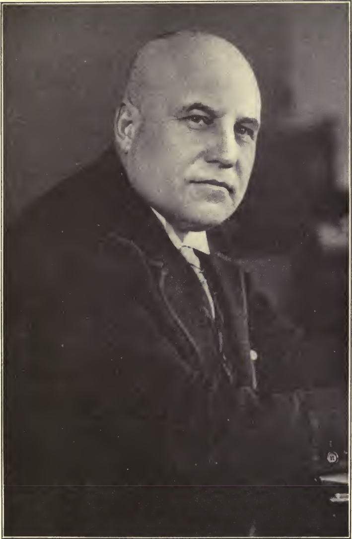
FRANKLIN K. LANE