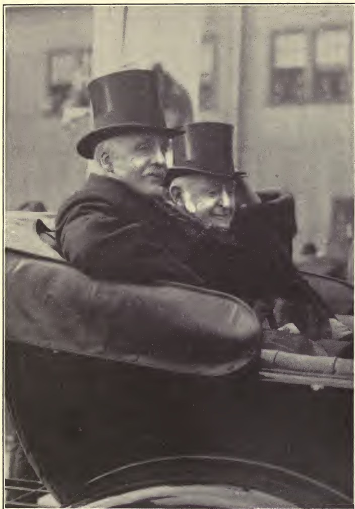
ARTHUR J. BALFOUR AND JOSEPH H. CHOATE