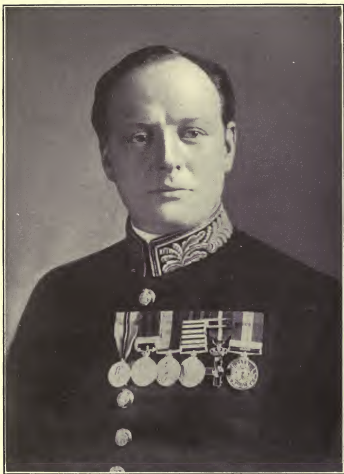
WINSTON SPENCER CHURCHILL