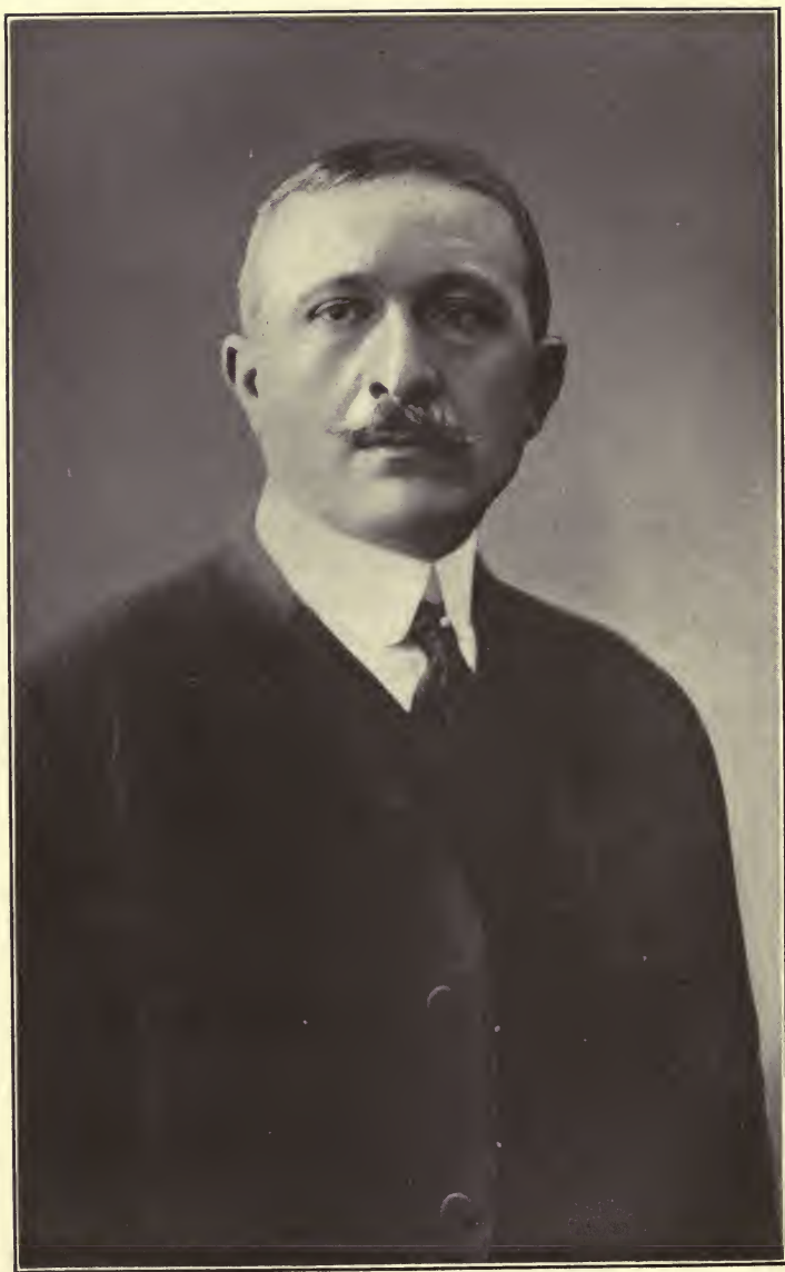
RENÉ RAPHAEL VIVIANI