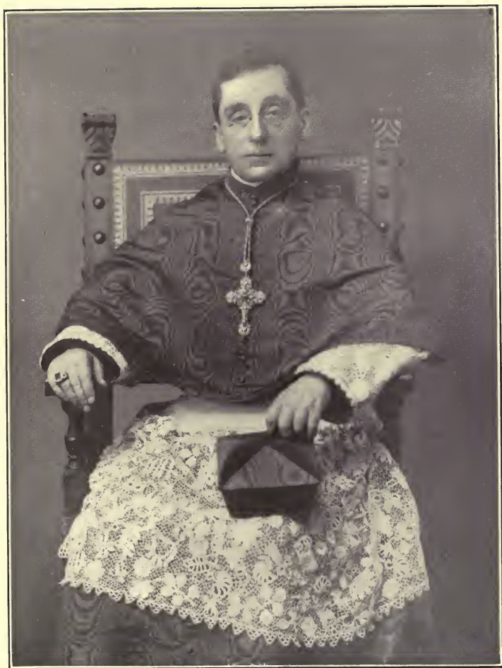
POPE BENEDICT XV