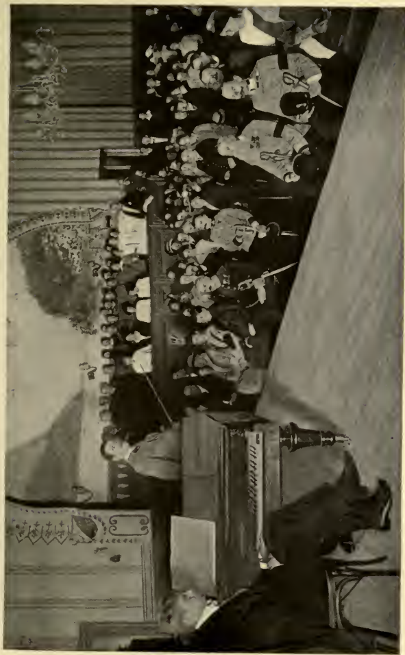
CONCERT GIVEN AT LEOBEN IN AID OF RED CROSS BEFORE DEPARTURE FOR FRONT