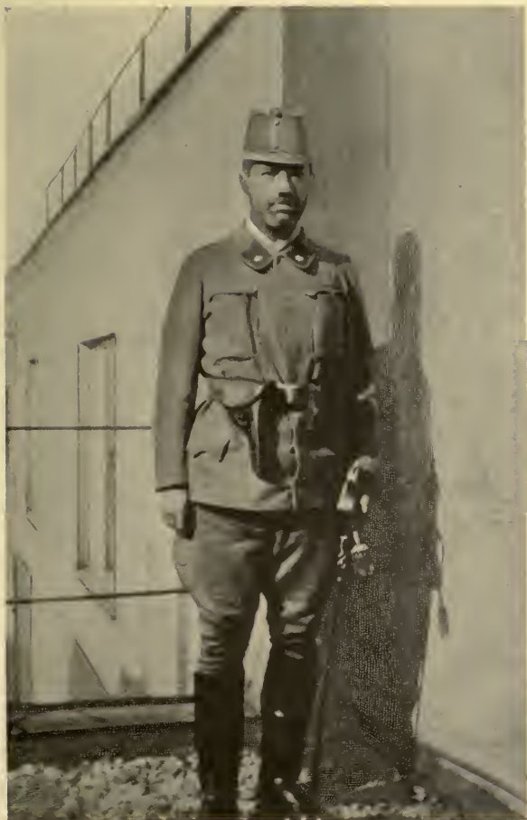
KREISLER AT THE FRONT, TAKEN AFTER THREE WEEKS' SERVICE