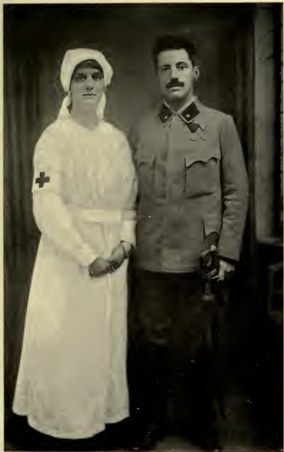
FRITZ KREISLER AS AN OFFICER OF THE AUSTRIAN RESERVE AND HIS WIFE AS NURSE