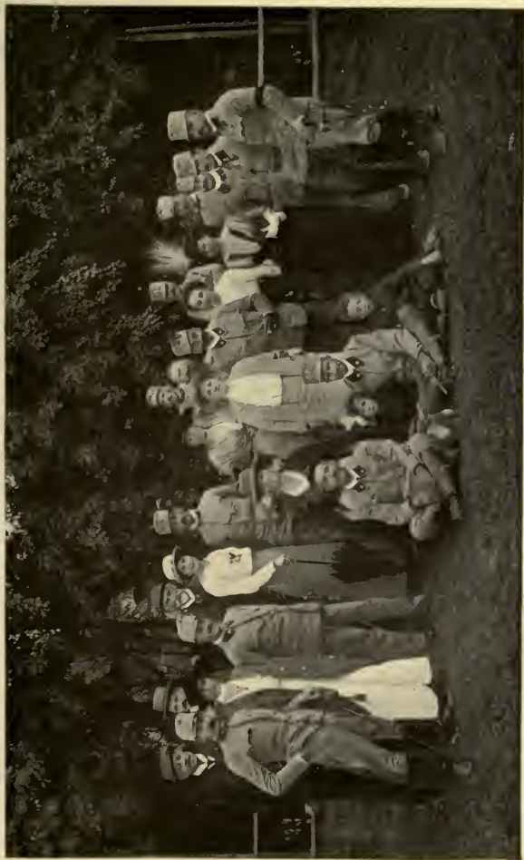
GROUP OF OFFICERS AND THEIR WIVES TAKEN AT LEOBEN BEFORE DEPARTURE FOR THE FRONT