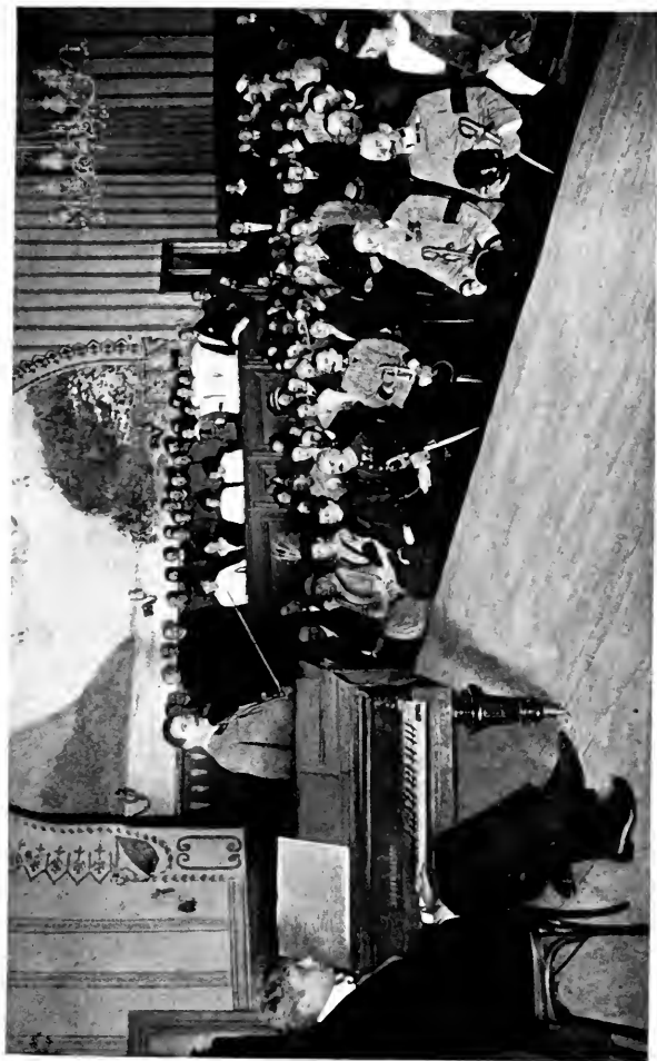
CONCERT GIVEN AT LEOBEN IN AID OF RED CROSS BEFORE DEPARTURE FOR FRONT