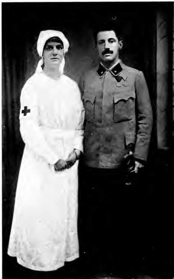
FRITZ KREISLER AS AN OFFICER OF THE AUSTRIAN RESERVE AND HIS WIFE AS NURSE