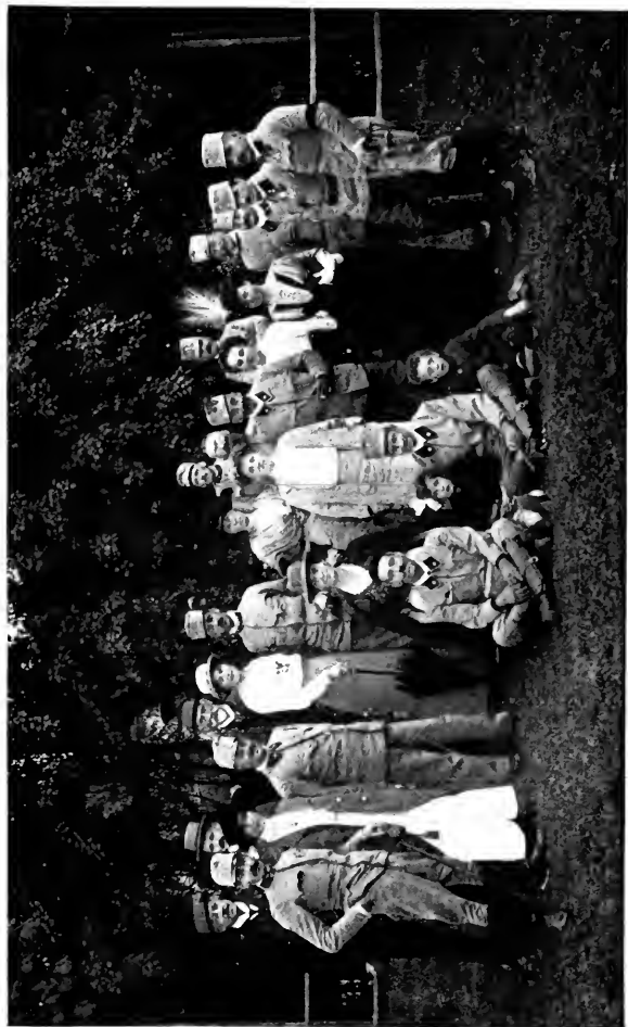
GROUP OF OFFICERS AND THEIR WIVES TAKEN AT LEOBEN BEFORE DEPARTURE FOR THE FRONT