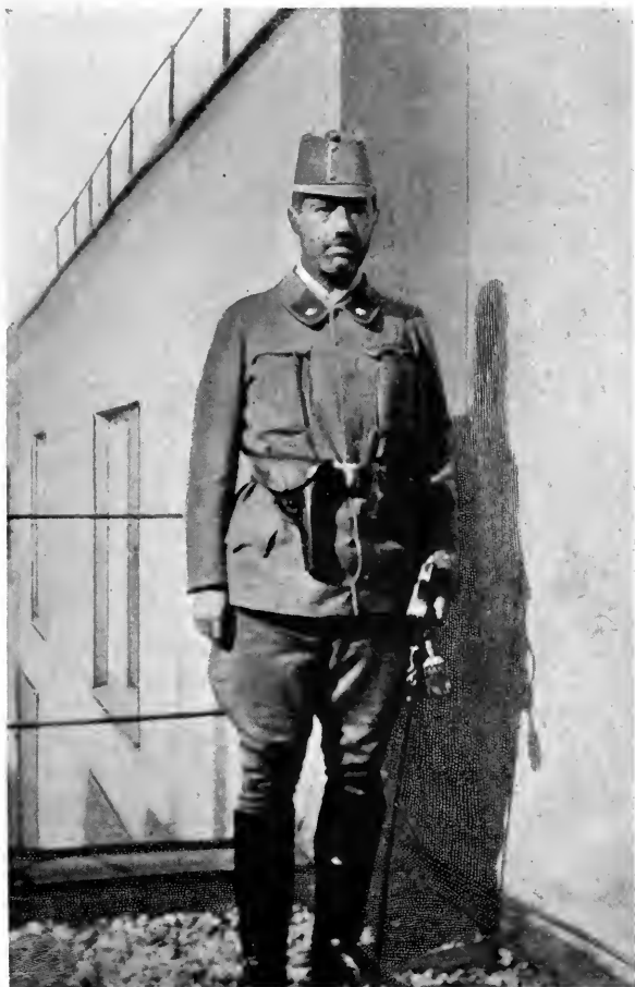
KREISLER AT THE FRONT, TAKEN AFTER THREE WEEKS' SERVICE