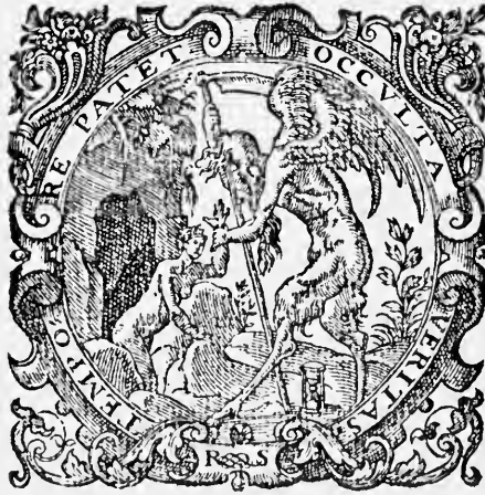
On the title page of the New Atlantis.

Therefore set it downe, that an Habit of Secrecy is both Politicke and Morall.