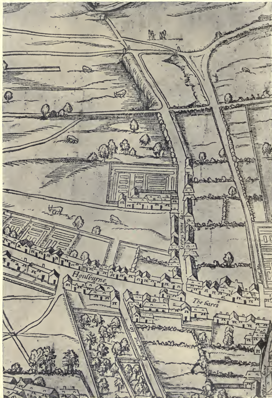
GRAY'S INN AS IT APPEARS IN THE MAP OF RALPH AGGAS