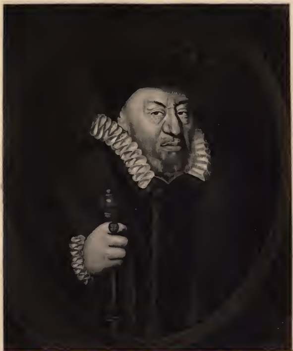
Sir, Nicholas Bacon