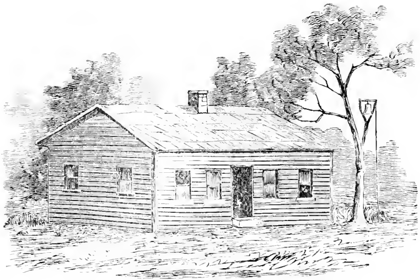
Ædificium Primum. Æd. 1836.