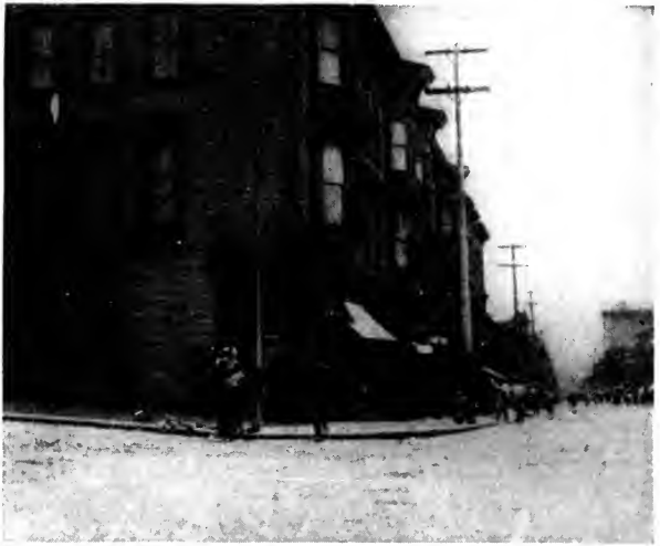
The "Dental Parlors" over the Post Office on Polk Street, San Francisco, where McTeague lived. A dentist's sign may be seen under the first side window of the second floor.