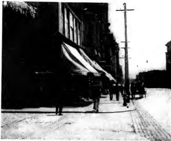
The coffee shop on Polk Street, San Francisco, where McTeague ate his meals. This and all the other buildings in these photographs were destroyed in the earthquake and fire.