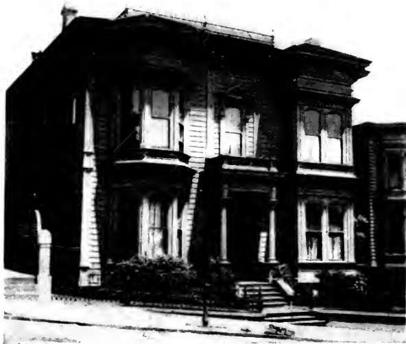
Frank Norris's home in San Francisco up to the time he went to Harvard. This is the house so carefully described in "Vandover and the Brute" where Vandover and the "Governor" lived.