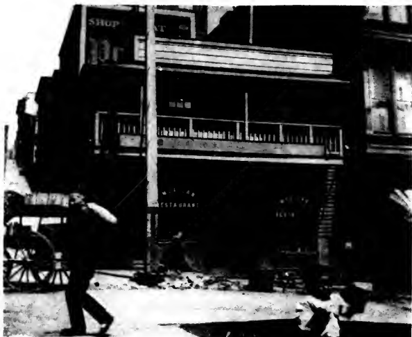
Luna's Mexican restaurant which figured so largely in "Blix" and other stories of Frank Norris.