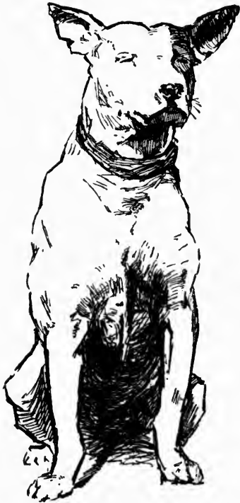
A sketch of his dog "Monk" by Frank Norris, one of the few examples of his work as an artist, that has been preserved.