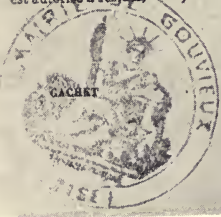
FRED MITCHELL'S PERMIT TO REMAIN IN THE WAR ZONE