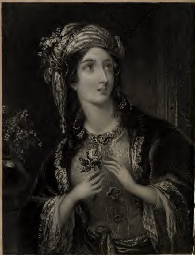
THE SULTAN'S DAUGHTER.