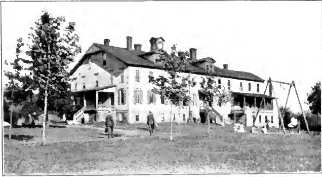
TUNESSA BOARDING SCHOOL